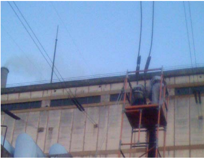
Fig.2: Repaired jumper after hotline work

Completion of this work resulted in avoiding 7-8 hours of outage on 500 MW Unit number-V, saving a loss of generation of about 4MUs without disturbing the system. This is one of the excellent example of how proper co-ordination between various utilities can be productive in handling emergency situations.