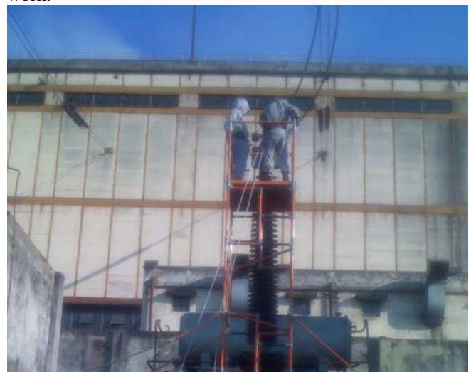
Fig.1: Damaged jumpers being repaired by Hotline unit

After inspecting the work spot, work was started on 31/01/2008 afternoon. Fig.1 shows damaged jumpers being repaired by Hotline unit. Bypass arrangement with flexible copper link was provided from bushing terminal clamp rod to the twin jumpers for both the individual bushings. This resulted in reduction of temperature from 125 0 C to 40 0 C. The dislocated strands of the conductors were repaired by using Hotline technique. Fig.2 shows repaired jumper after Hotline work.