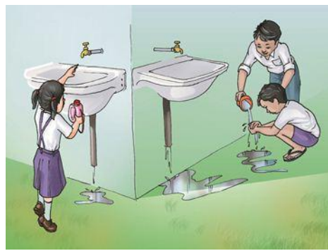
Figure 4. School facilities not child friendly