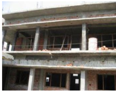
Figure 5. Safer school with modern materials