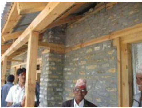
Figure 5. Safer school with local materials