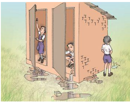
Figure 3. School facilities not child friendly