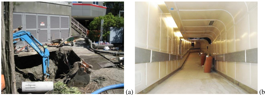
Figure 2. Observed damage throughout hospital campus: a) liquefaction-induced damage to the main sewer line, and (b) damage to Riccarton underground tunnel.

There were no catastrophic structural failures (i.e., local or global collapses) to any of clinical or non-clinical buildings of Christchurch Hospital that were operating at the time of the 22 nd February earthquake. However, severe structural damage did cause some forced closures to the underground tunnel carrying lifelines running below Riccarton Ave was still unusable at the time of interviews (Figure 2b).