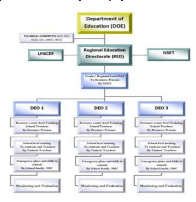
Figure 1. Flowchart for Implementation Earthquake Preparedness in Schools

The proposed technical committee will be guiding the curricula development team through 3 meetings, one to define the content and process, another during the course of development of the materials and finally, after completion of the draft materials, for review and feedback. The DoE will be providing overall guidance and monitoring for the program.