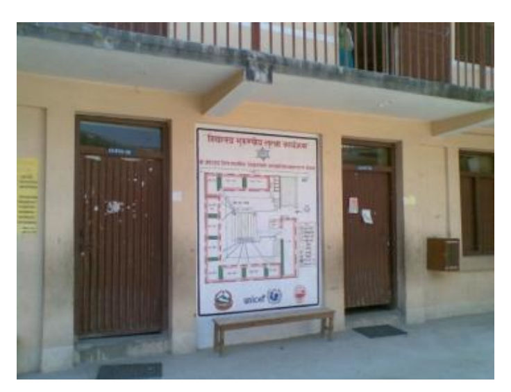
Figure 6. Signage of Emergency Evacuation plan on front wall of school GON /UNICEF/NSET (2011)

some facilities such as boards, chairs and tables to run the office. To conduct drill minimum required first aid items will be placed in all schools. The students club should take responsibility of maintaining the items and will use during further drills and in case of emergency. The drill consisted of keeping safer (Duck Cover and Hold), Safe Evacuation during emergency, Head Count after evacuation and Sharing and de-briefing.