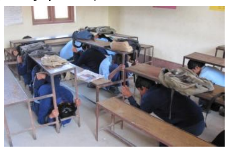
Figure 7. Duck, Cover and Hold during Drill in school