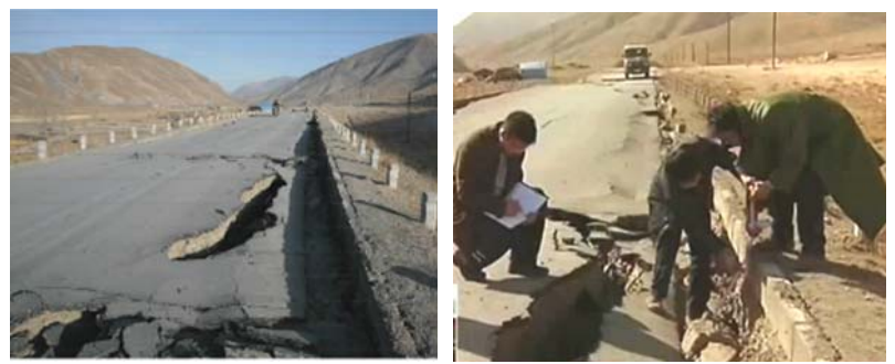
a) Highway foundation settlement and crack

A great number of Geotechnical disasters were trigged in this earthquake. According to the report of China Earthquake Administration (CEA), there were about 295 landslides and a large number of ground fissures in this earthquake affected area. The landslide was formatted partly because of frozen soil heat-thaw. The transportation system, water-electric power and water-supply were interrupted by foundation settlement, landslide, debris and collapsed rock and soil (Figure 8).