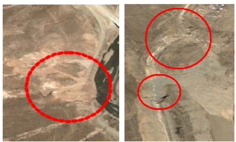
Figure 2.Interrupted road by landslide and collapsing

In this meizoseismal area, there are only two main highways, named G214 and S308 respectively. During this earthquake, two highways had been damage in different damage degree, the typical earthquake damage included foundation failure, bridge and culvert damaged, etc. The highway foundation split and settlement were found in the length of 875km everywhere. About 87 landslides occurred in G214 and S308 in this earthquake (Figure.2). The ground rupture due to seismic fault was an important reason to interrupt transportation (Figure.3).