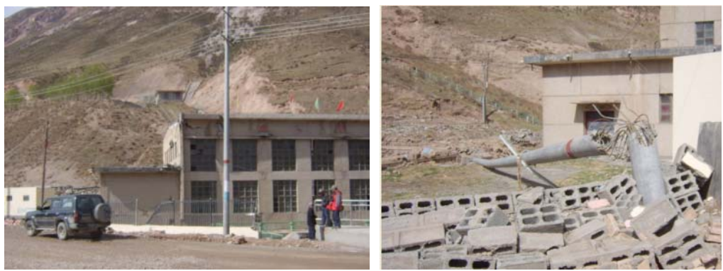
a) The waterpower factory damage

In this meizoseismal area, the electric-power system was immediately damaged after earthquake. Until 16<sup>th</sup>, April 2010, the electric-power partly recovered to use temporary generators. Because power supply was based on small waterpower factories, the electric-power lost their function due to the damage of waterpower factories (Figure.5)