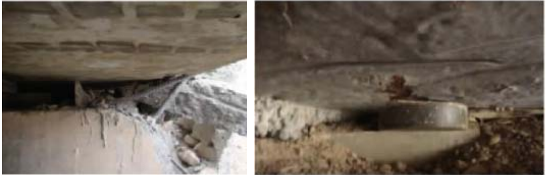
c) Fractured cap beam of abutment d) Baring separation

a) Contra rotating and snake motion b) Bearing displacement and fractured seismic anchor