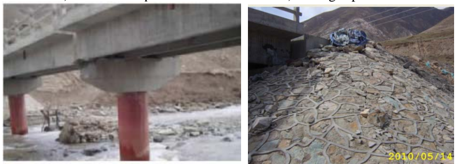
e) Beam displacement and fractured seismic anchor f) cone protection damaged