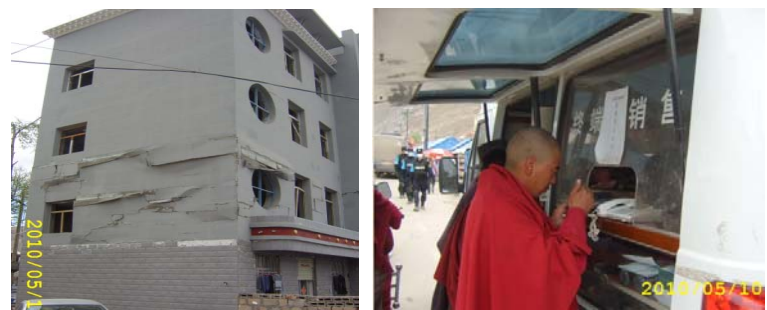
Figure 7. Damaged building and emergency telecommunication based on satellite communications

earthquake impacted region lasted more than 30 days.