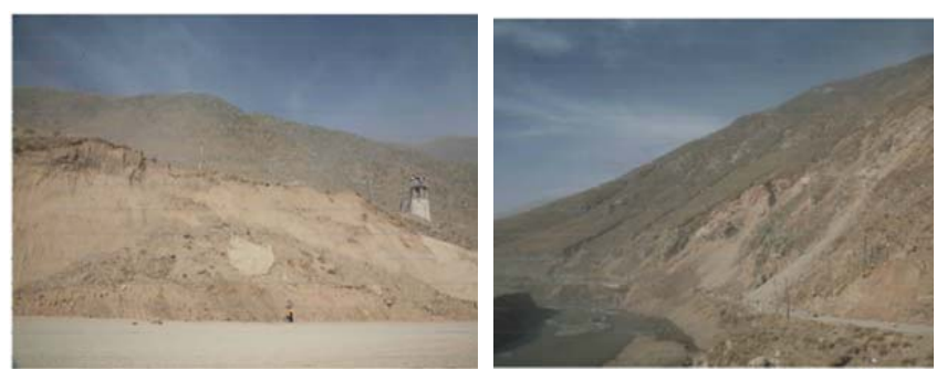
b) Covered highway by landslide Figure 8. Damaged highway due to geotechnical disasters

Equipments and apparatuses belonging to lifeline systems were buried and damaged due to these trigged geotechnical disasters too. During the procedure of rescuing and post-earthquake rehabilitation, the transportation system was interrupted by landslides, debris, and collapsing rock and soil due to the frozen soil settlement. It is these geotechnical disasters that made the emergency response difficult. Until two months after earthquake, the frequency of landslide and debris was still higher than that of earthquake invading ago. A great number of geotechnical disasters, particular landslide, debris and collapsed rock and soil were the most important factor to bring such a terrible destructive disaster. At present, details slope failure mechanism related frozen soil and risk zonation were still going on along the main fault zone.