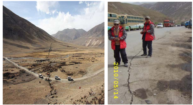
Figure 3.Damaged road by active fault

The bridges were damaged in different degrees were damaged in the affected area; most of bridges in Yushu were simply supported girder. Seven bridges in G214 and S318 were damaged from moderate to heavy damage. In Gyêgu town, the main seismic fault passed through one Girder Bridge, and made it diversely contra rotate and have snake motion in deck, separate between the deck and bridge approach (Figure.4). Damage seems to be due to a combination of ground surface rupture and strong ground shaking. Some typical bridge damage is shown in Figure 4(Figure 4).