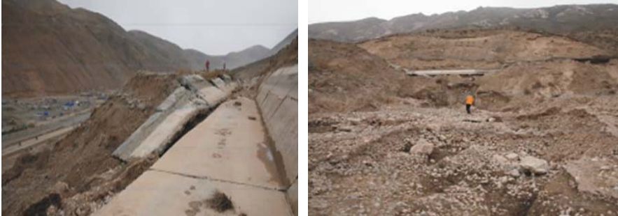
c) Foundation failure of ditch due to landslide d) Figure 6. Water-supply damaged due to landslide and active fault