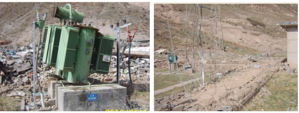
c) Transformer displacement d) snapped electric line Figure 5. Electric power damaged due to strong ground motion