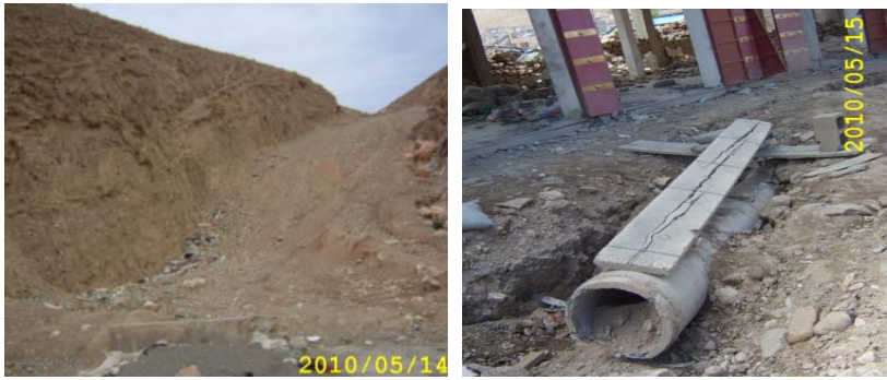
a) Cannel buried by debris or landslide b) damaged pipeline near the active fault

Around Gyêgu town, the water-supply system was damaged due to the strong ground motion, active fault and landslide or debris. Because the water-supply system in Gyêgu town consisted of concrete pipeline, ditch and canal on the ground, they are vulnerable to strong ground motion, landslides or debris (Figure 6). The emergency water-supply was set up by temporary wells and plastic pipeline until April 17th 2010.