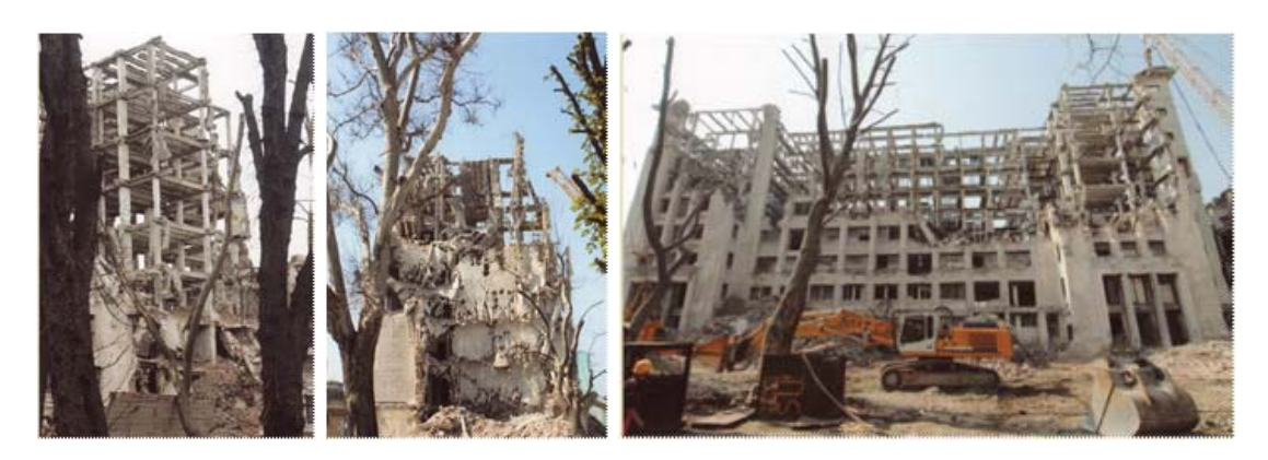
Figure 6. MICM building, Calea Victoriei, Bucharest

4.2.1. Impressive historic monuments demolished due to listing under class 1 of seismic risk The tall RC structure of the former Ministry of Industry (MICM) has been demolished in 2007 due to seismic fragility of its RC framed structure. The building was the most impressive Art Deco building in Bucharest listed as Historic Monument.