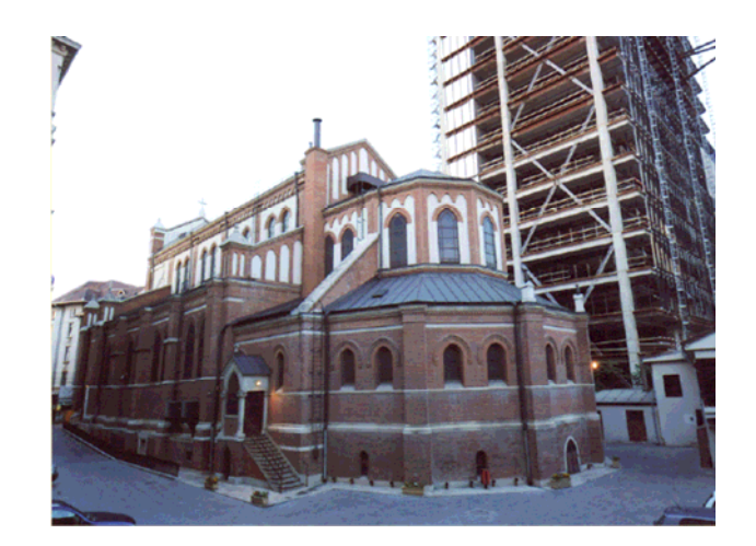
Figure 8. "Saint Joseph" Cathedral, in central Bucharest

4.2.4. Buildings subject to demolition / demolished located in so-called "protected urban areas" Visarion 8, building was finished in 1911, and the urban renewal plan for Lascar Catargiu Blvd., between Piata Romana (the Roman Square) and Piata Victoriei (Victory Square), was implemented in the period 1895 – 1899, in the French Academy spirit, according to design delivered by architect I.D. Berindei. The building is also part of the protected area of Dinu Lipatti House, 12 Lascăr Catargiu Blvs., a historic monument, the List of Historic Monuments 2004, entry no. 615/B-II-m-B-18330. The building is located in a "protected area" yet, it has benefited from no protection at all. The roof burnt at the be-ginning of 2007 and man, to the present state of utter ruin, has systematically damaged the building, Figure 9. The "Collapse Hazard" sign placed on the facade of the building in March 2007 made a clear statement with respect to the destined end of that elegant building from the very heart of Bucharest. The application to declare the building a historic monument filed by the National Institute for Historic Monuments (no.351/23.03.2008) was rejected by the National Commission for Historic Monuments. Unfortunately, existing law on protected areas in Romania cannot legally prevent the demolition of the buildings located in such areas.