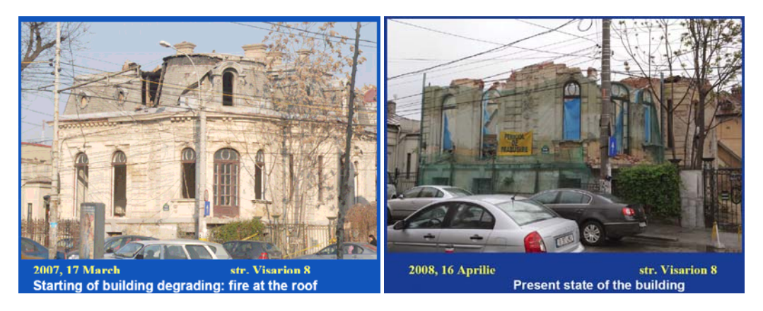
Figure 9. Bucharest heritage building in the city center intentionally prepared for demolition

4.2.4. Buildings subject to demolition / demolished located in so-called "protected urban areas" Visarion 8, building was finished in 1911, and the urban renewal plan for Lascar Catargiu Blvd., between Piata Romana (the Roman Square) and Piata Victoriei (Victory Square), was implemented in the period 1895 – 1899, in the French Academy spirit, according to design delivered by architect I.D. Berindei. The building is also part of the protected area of Dinu Lipatti House, 12 Lascăr Catargiu Blvs., a historic monument, the List of Historic Monuments 2004, entry no. 615/B-II-m-B-18330. The building is located in a "protected area" yet, it has benefited from no protection at all. The roof burnt at the be-ginning of 2007 and man, to the present state of utter ruin, has systematically damaged the building, Figure 9. The "Collapse Hazard" sign placed on the facade of the building in March 2007 made a clear statement with respect to the destined end of that elegant building from the very heart of Bucharest. The application to declare the building a historic monument filed by the National Institute for Historic Monuments (no.351/23.03.2008) was rejected by the National Commission for Historic Monuments. Unfortunately, existing law on protected areas in Romania cannot legally prevent the demolition of the buildings located in such areas.