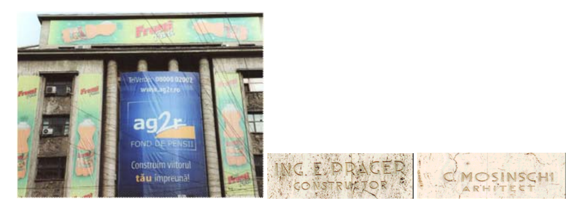
Figure 10. Façade of the G. Enescu 27, historical building

The visual content of Figure 6 to Figure 10, presenting typical situations of aggression against the built-on heritage of Bucharest calls for an urgent amendment of the legislation on protection and the real estate policy on demolition of buildings-historic monuments or buildings located in "protected areas" in Romania.