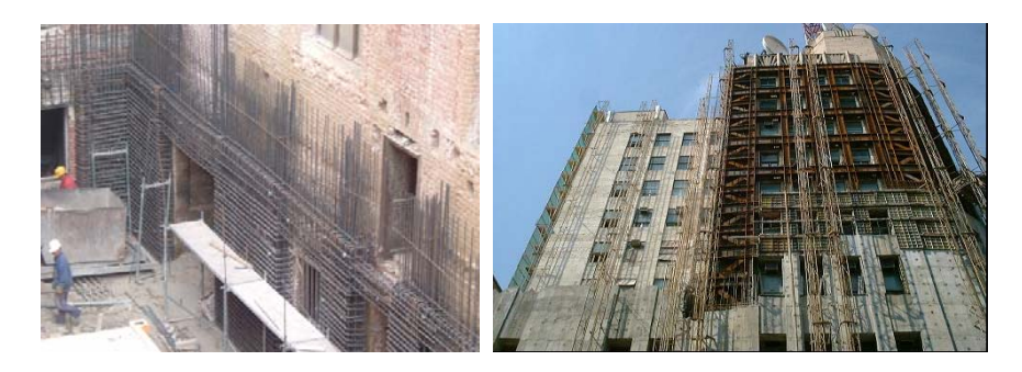
Figure 4. Retrofitting of the Palace of Justice - left (2006) and Telephone Palace - right (2002)

The Historical Monuments List prepared by the INMI, National Institute for Historical Monuments, contains more than 25 cultural heritage palaces in Bucharest. From those, the several "seismic risk class 1" palaces where considered for priority strengthening: (i) Multistory steel structures: Ministry of Transport, Constructions and Tourism; (ii) Multistory reinforced concrete structures: Romanian Government Palace (under strengthening) and City Hall of Sector 1 (under strengthening), Bucharest; (iii) Combined masonry and RC buildings: Royal Palace i.e. National Museum of Art of Romania (central building) etc. Only the Palace of Justice and Telephone Palace are now fully retrofitted, Fig. 4.