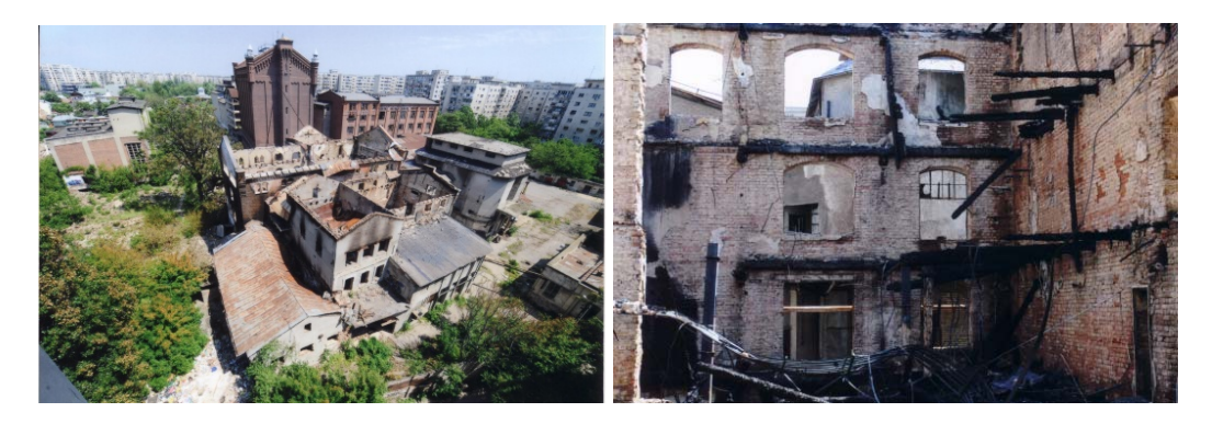
Figure 7. Present-day destruction for "encouraging" self-collapse of the Asan Mill ( Moara lui Asan ), industrial heritage in Bucharest

Asan Mill, built in 1853, is the first steam mill in Romania. It is an industrial architectural monument under category A, the List of Historic Monuments, code B-II-m-A-19692. The building is made of masonry walls with wooden boards. The mill was set on fire on May 14th, 2008 for a thorough and rapid extermination of the wooden boards and roof ridge. The masonry walls show signs of local degradation of bearing walls, deliberately caused by man, Figure 7.