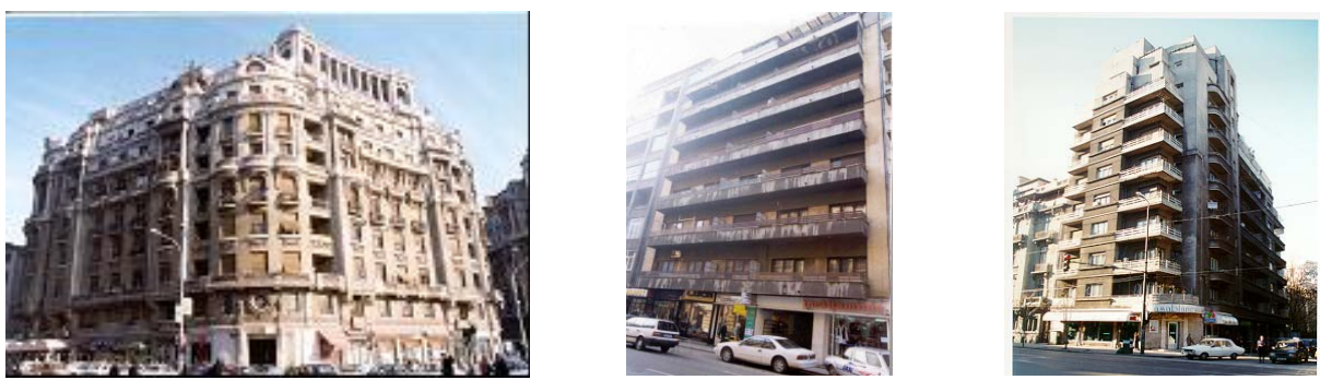
Calea Victoriei 2-4