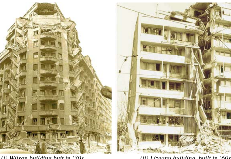
(i) Wilson building built in '30s (ii) Lizeanu building, built in '60s (ii) Collapse of the building soft story at the ground level