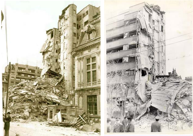
(i) Typical total collapse of pre-war tall reinforced concrete buildings