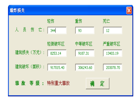
Figure 5.2. Results of casualties and building loss

For assessment of building damaged, three levels are used with level 1, 2 and 4 in Tab.3.2. Final, the results of casualties and building loss are calculated. In Fig. 5.2, the results include the number of casualties, construction area and losses of buildings damaged in different areas.