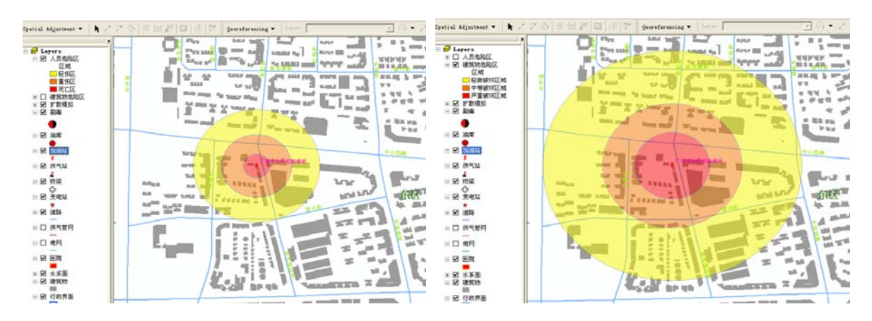
Figure 5.1. Coverage of casualties (left) and coverage of building damaged (right) after explosion

As an example, assume the explosion source total has energy with 10 t TNT. Based on GIS, the coverage of casualties and building damaged are shown in Fig. 5.1 and Fig. 5.2.