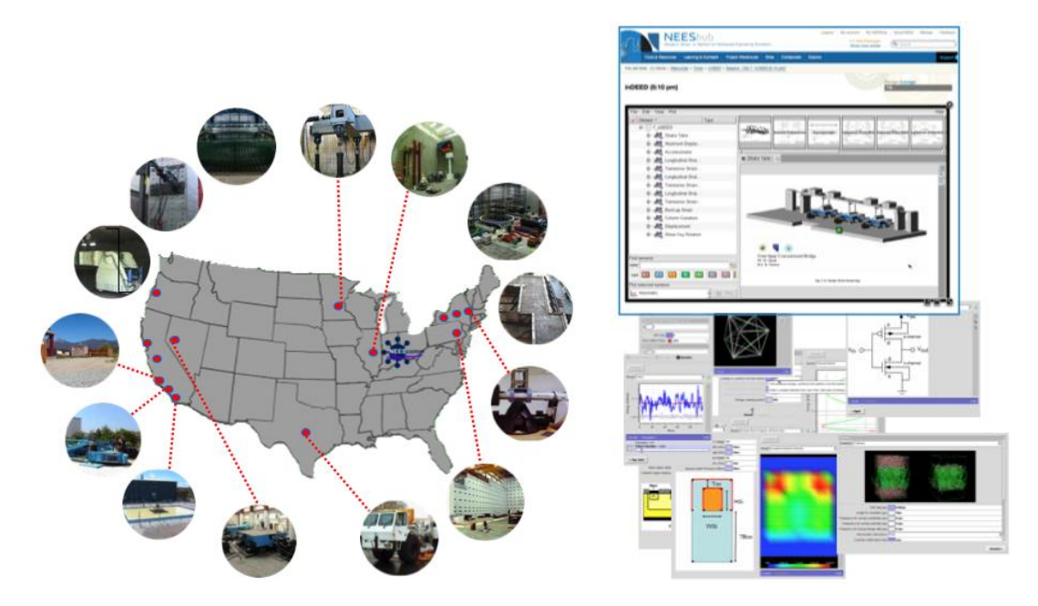
Figure 2. NEES Facilitates innovative research and cyberinfrastructure to realize this Vision.