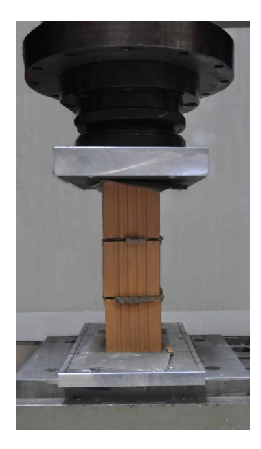
Figure 5.2. Unidirectional compression test on one 1:2-scale masonry triplet.

For each series, six columns composed of three bricks were produced the same day. They were built as it is usually done in praxis: first a thick layer of mortar was applied on the lower brick and the thickness of the mortar layer was assured by hammering on the upper brick until the wished thickness was reached. For reasons of reproducibility, it was decided not to wet the bricks before applying the mortar joint. The uprightness of the columns was controlled with the help of a water level and the resulting thickness was measured after curing. The triplets cured between 21 and 23 days until they were tested under uniform compression as shown in Fig. 5.2. The load introduction at top and bottom of the triplet was provided with a fast curing cement layer put between two plastic sheets. The loading velocity was chosen in such a way that the failure occurred after 15 to 20 min after the beginning of the loading. The results of the compression strength are shown in Fig. 5.3. (a).