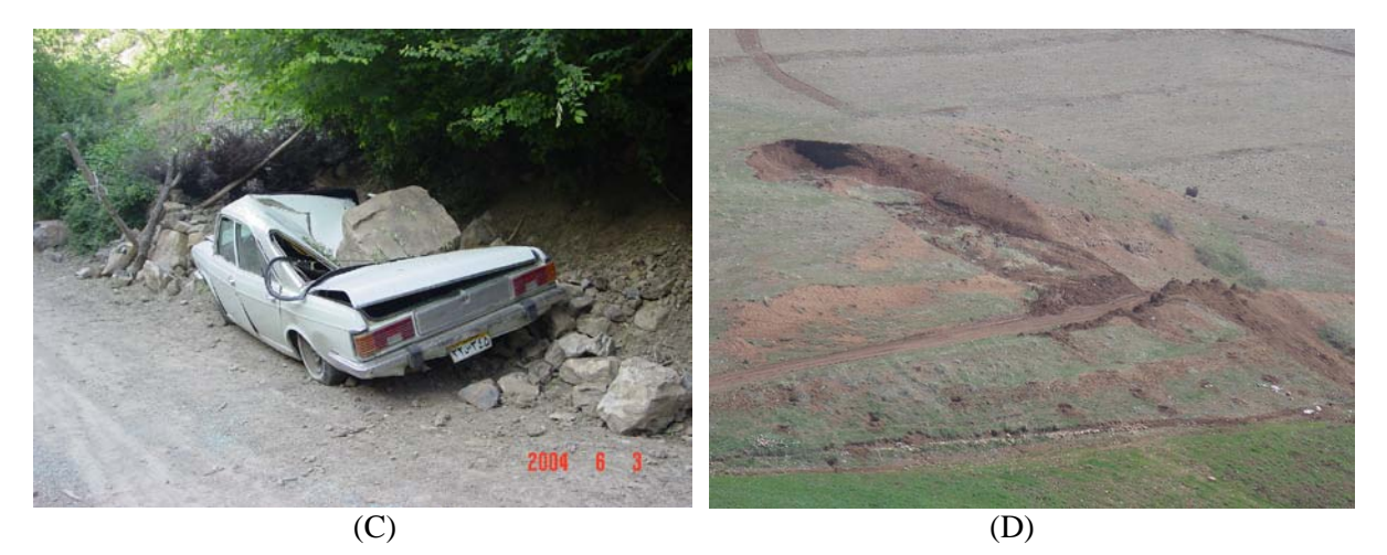
Figure 2: Some of the impacts of geo-hazards in recent Iran's earthquakes; A: Rock fall due to Manjil Earthquake (1990) on main Tehran-Rasht Road; B: Aerial photo of land-subsidence due to Collapse of Qanats in Bam Earthquake of 2003; C: Rock fall on passing vehicles in Koujour Earthquake of 2004; D: Landslide in Silakhor Earthquake of 2005