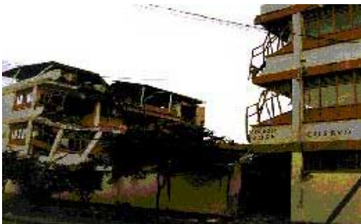
Photo 14: Collapse of structure belonging to educational sector due to short columns

The structures of a large number of schools and colleges were greatly affected. It is estimated that nearly 80% of the educational buildings in the zone suffered moderate to severe damage (Photos 14 -15). Many health facilities serving small populations had serious damages; Armenia's main hospital had to be partially closed due to non structural damage that impeded its function. It is important to note that this hospital was in the process of being seismically retrofit but the intervention had not yet been completed. The main buildings of the National Police and the Fire Department both collapsed, killing a significant number of police and firemen; personnel critical to emergency response (Photos 16 - 17). The majority of the churches of the city and of the villages surrounding the epicentral zone suffered serious damage and some roofs suffered total collapse.