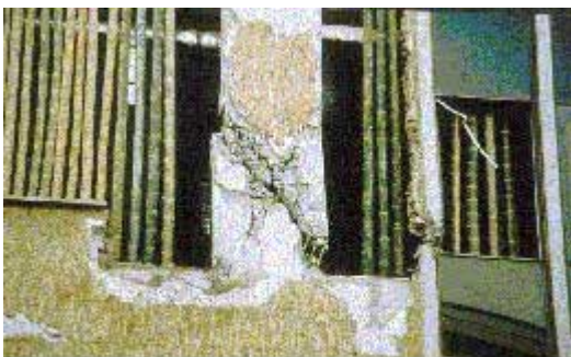
Photo 8: Fragile failure of a column due to insufficient transversal reinforcement