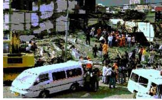
Photo 19: The collapse of buildings blocked some streets impeding the moving of rescue teams