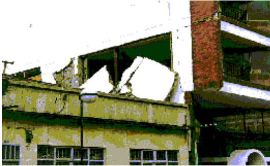
Photo 10: Brick masonry infill walls failure because lack of connection