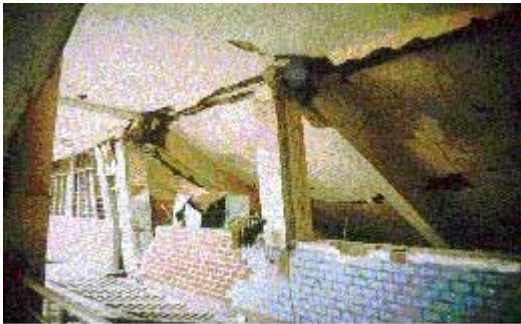
Photo 6: Failure of beam-column joint due to lack of transversal reinforcement