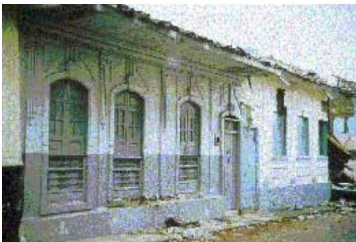
Photo 12: Bahareque de guadua (bamboo) structure, "temblorero style"