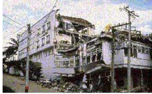
Photo 17: Older structure housing police station, in which many policemen lost their lives