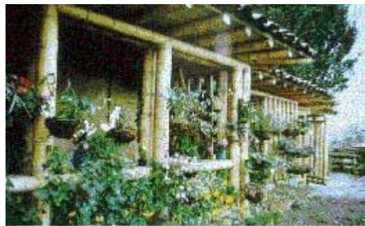
Photo 13: Guadua structure displaying satisfactory, seismically resistant behavior