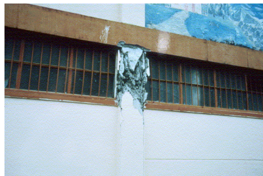
Photo 9: Short column effect due to adverse interaction of brick masonry walls