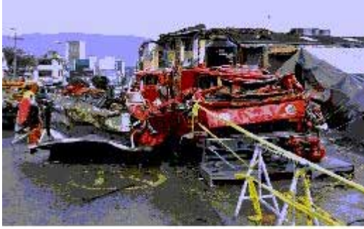
Photo 16: Condition in which fire trucks remained after the collapse of the fire station