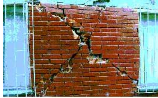
Photo 11: Shear failure in brick masonry infill wall of a reinforced concrete frame