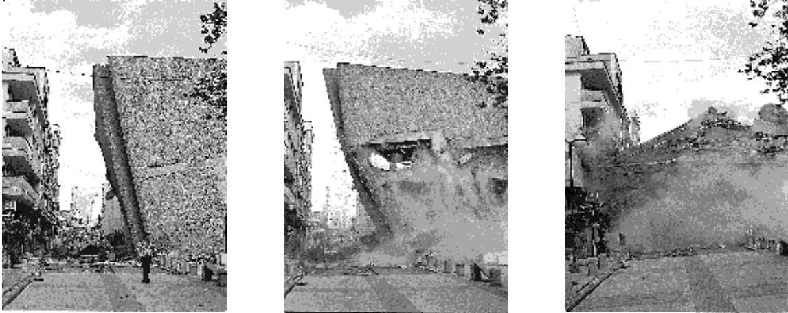
Photo 5: Photographic sequence of the collapse of modern building during the 5:40 p.m. aftershock.