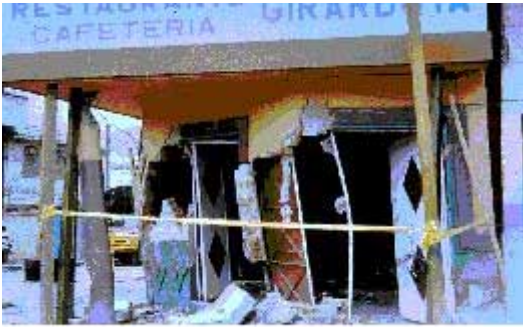
Photo 1: Seriously damaged non earthquake resistant brick masonry building

In general, many buildings in the central sector of the city of Armenia as well as a significant number in Pereira suffered severe structural damage due to the use poor quality materials and poor design and construction. Inadequate dimensions of structural elements and lack of confinement by transversal steel in columns and beams facilitated the occurrence of failures due to shear force and, in some cases, caused the total or partial collapse of buildings (Photos 5 - 9). Infill brick masonry walls and nonstructural elements were heavily damaged because the lack of displacement control (Photos 10 - 11). On the other hand, local traditional structures constructed by means of an empirical technology termed "bahareque de guadua" (bamboo), which in the last century was known as the " tembloero style" by the first residents of the zone, performed very well in the earthquake (Photos 12 and 13). However, while displaying a local seismic culture, some of these buildings themselves collapsed, or had roofs that collapsed, due to poor maintenance or due to the fact that along the years they were "contaminated" by unreinforced masonry walls in the interior of their facades. As the masonry walls collapsed due to instability, ties and resistance induced the total collapse of the building. Nevertheless, according to the information obtained during the emergency response efforts, these buildings caused the least number of injuries due to their light weight.