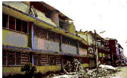
Photo 15: Collapse of school building of reinforced concrete frame system