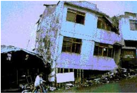
Photo 2: Collaps of unreinforced, non earthquake resistant brick masonry building