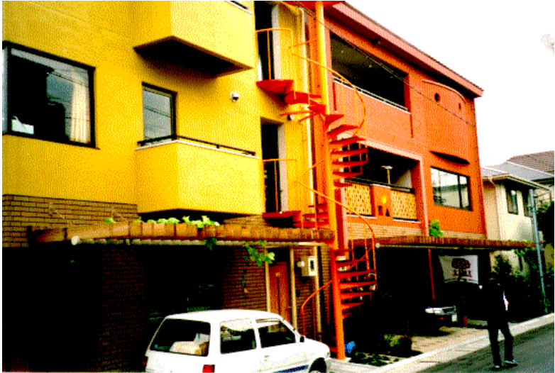
Ju-shi-so project which consolidated lots and provided a high quality building eligible for subsidy

Mitsujugyo: high-density urban improvement project The intent of mitsujugyo is to subsidize rebuilding projects such as wooden apartment, townhouse and old single family houses. Residential or mixed use projects are eligible.