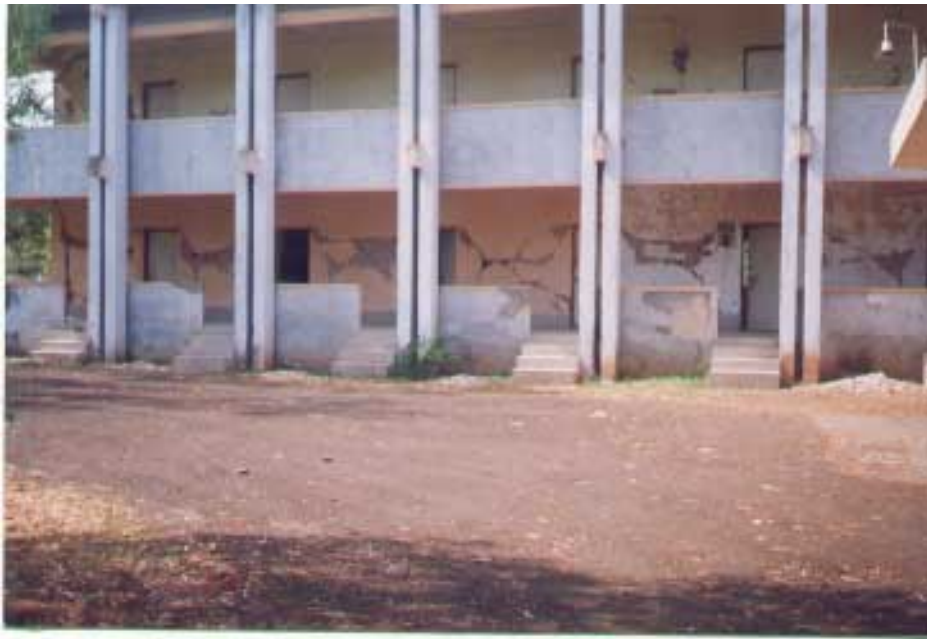
Photograph no. 4:- shows cracking of walls due to very large size of cupboard.

A very large size of cupboard reduced the strength of load bearing wall. So, this size of cupboard must be reduced by providing new load bearing brickwork or by providing concrete. Proper bond must be achieved between new and old work. Fix welded wire mesh and chicken mesh on cracked portion of wall. Plastering must be done with rich cement mortar on this surface.