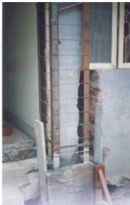
Photograph no.6:-retrofitting of column with the help of structural angles and concrete jacketing