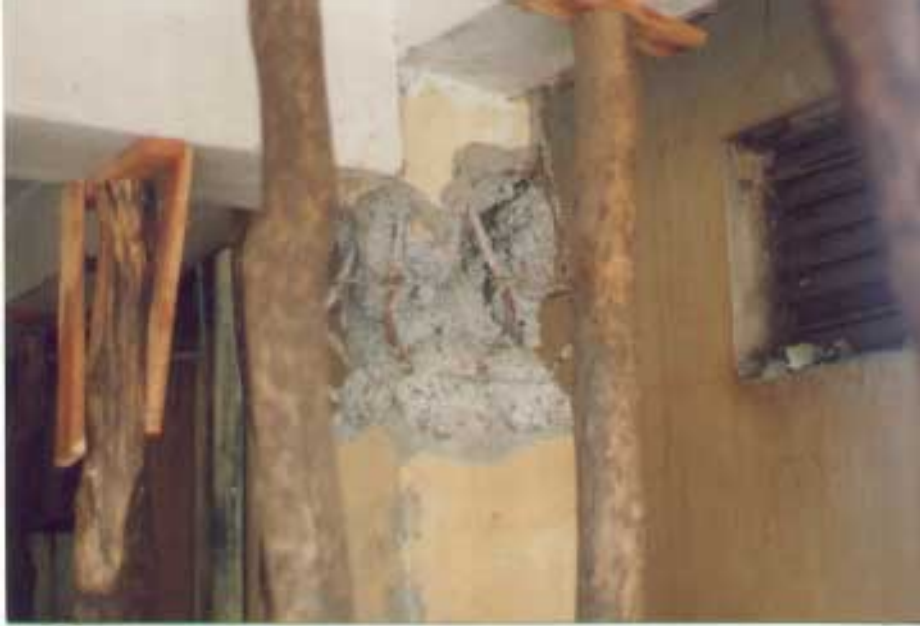
Photograph no.8:- brittle failure of column of a building with flexible first storey.