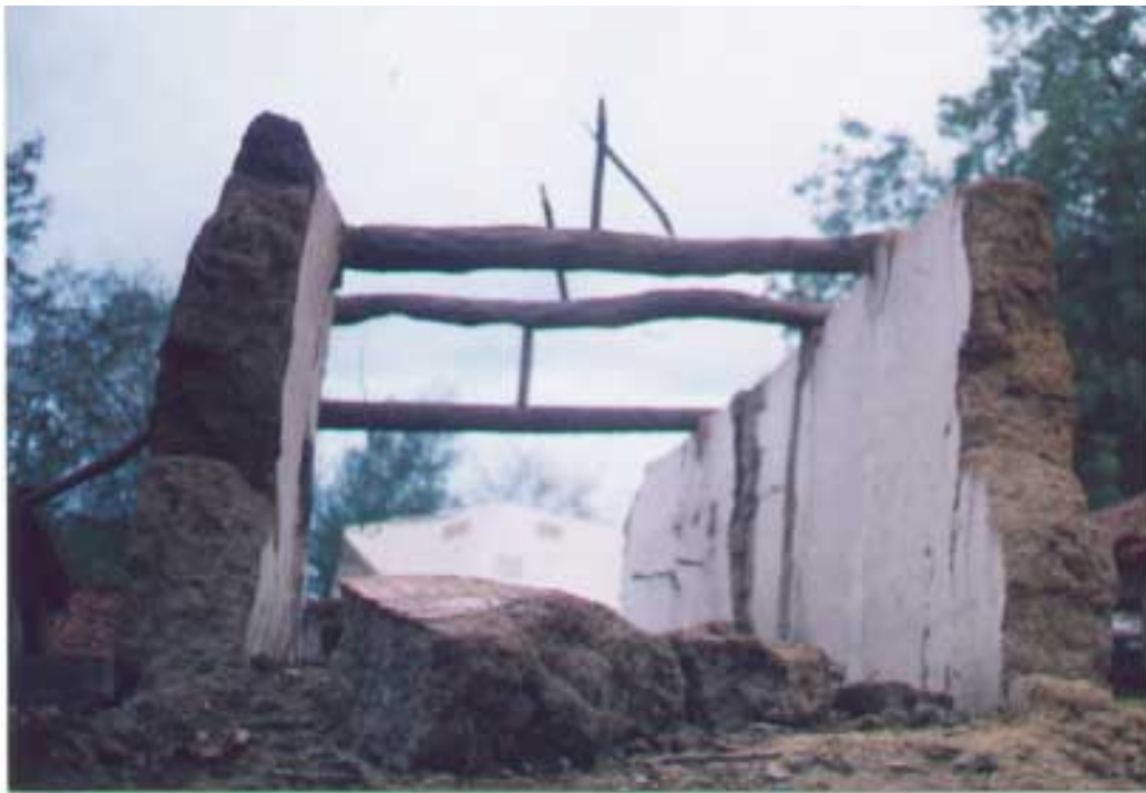
Photograph No.1: -Collapse of gable wall & roof of rural building constructed with mud.