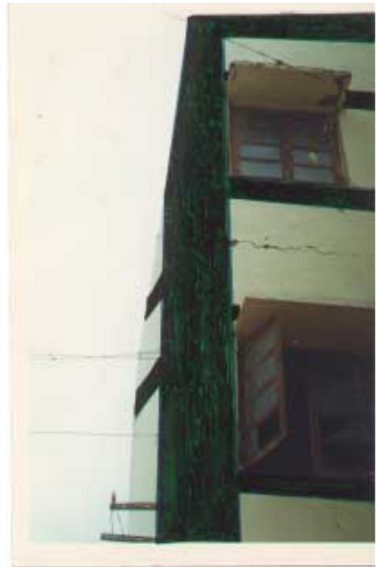
b) GREEN COLOUR SHOWS VERTICAL SPLINT AND HORIZONTAL BANDAGE