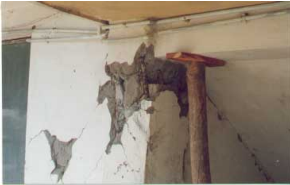
Photograph no.5:-brittle failure of short column supporting staircase midlanding.

It was observed that the building resting on soft soil deposit and madeup grounds were badly damaged. This was due to local amplification of ground motion.