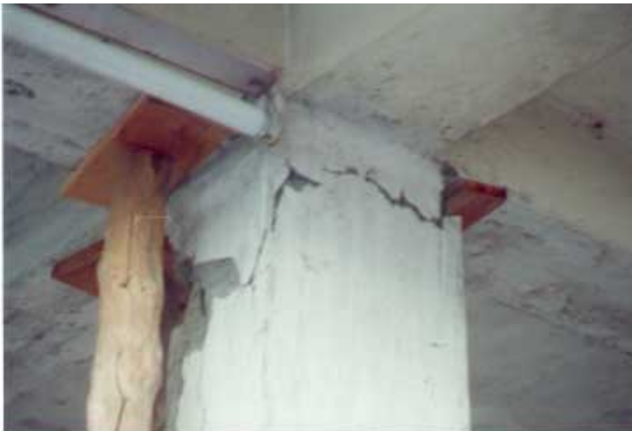
Photograph no.9:- severe cracks in column of a building with flexible first storey.