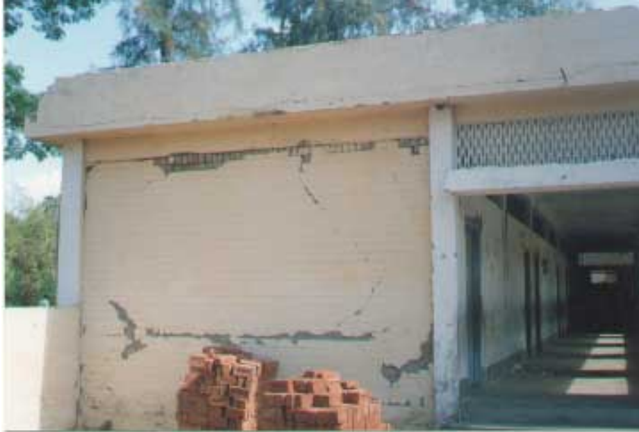
Photograph no.7:- separation of wall panel from main frame

For retrofitting of this brick panel. Remove old plaster. Fix the strip of welded wire mesh and chicken mesh on the frame (i.e. on columns and beam) and on brick panel. These wiremeshes must be properly anchored to the frame and brick panel. This treatment must be done on both sides of wall. Plaster the surface with cement mortar (1:4).