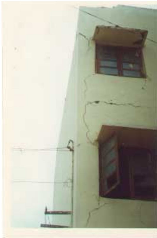
a) ACTUAL CONDITION

It was observed that the buildings without continuous lintel band suffered badly. Separation of walls was observed. Most of the damages are due to the faulty construction practices such as, providing doors and windows near corner without taking proper precaution, providing very large size of opening. Providing foundations to some selected walls only. So, some walls were 100mm thick partition walls, which were unable to provide any resistance during earthquake shaking.