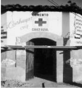
Figure 21. Stress concentrations.

These types of structures performed well during the Villaflores earthquake, even though wooden poles were used as dalas and castillos, (figure 22). In figure 23, a reinforced masonry structure presented no damage, while this adobe structure was completely collapsed. Those structures that performed poorly during the earthquake were because of the poor structural configurations, irregularities in plan and elevation, weak first stories, (figure 24), and inadequate lateral reinforcement.