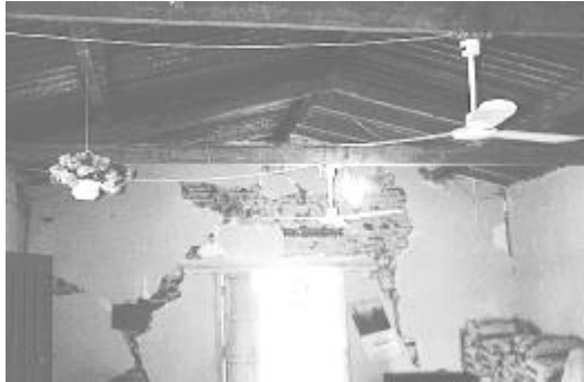
Figure 3. Typical roof system in the epicentral region of Ometepec.

The churches, that sometimes are the largest structures in these communities, were also affected in the Ometepec earthquake, most of them presented heavy damage, but no collapses were reported. Cracks and damages from past earthquakes were retrofitted with new materials, sometimes both vertical and horizontal reinforced concrete elements called castillos and dalas, were embedded in the damaged walls as a retrofitting and reinforcing technique.