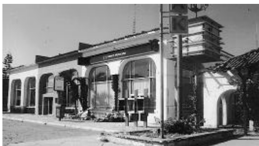
Figure 17. Failure of corridors in the shopping mall complex.

Steel structures, in general, performed well during the earthquake, but a shopping mall in Manzanillo did not have an adequate performance. Four separate steel buildings comprised this shopping mall complex. A light steel-framed structure was the backbone of each of the separate square-shaped structures. Corridors of reinforced masonry walls surrounded each structure on two or three sides. Many plan and elevation irregularities, with structural elements having great differences in stiffness, resulted in heavy damage. The poor anchorage and overlapping in reinforcing bars in the corridors of the shopping mall allowed partial collapse, and ten people were reportedly killed, (figure 17).