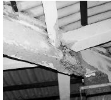
Figure 8. Inadequate position of structural elements.