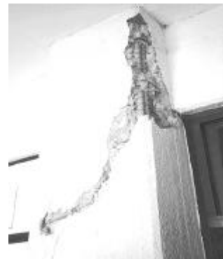
Figure 26. Inadequate stirrup spacing.