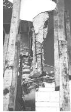
Figure 12. Inadequate anchorage of castillos.

In addition, there were also inappropriate structural configurations, such as excessive door and window openings on the first floor; corner buildings with high plan eccentricity; irregularities in elevation and plan; and, in some cases, the lack of adequate separation between neighboring structures resulting in pounding between them.