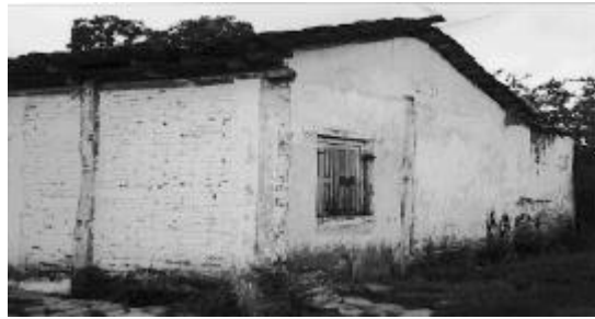
Figure 22. Wooden poles used as dalas and castillos.