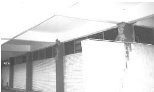
Figure 25. Short column configurations led to poor behavior.