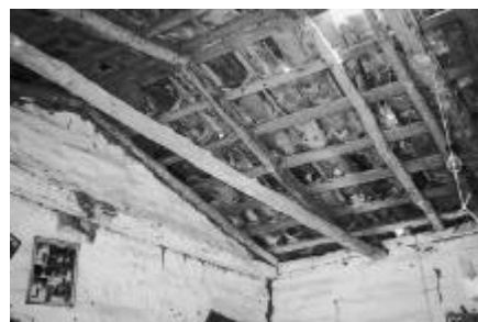
Figure 18. Roof system in Villaflores, Chiapas.