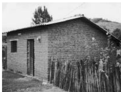
Figure 20. High quality adobe brick houses.