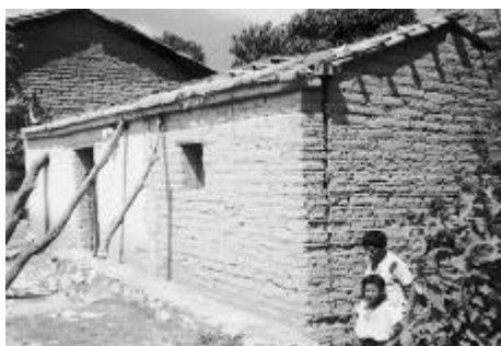
Figure 19. Inadequate connection in the corner walls.

Those adobe structures observed in Villaflores are very similar to those in Ometepec and Manzanillo, except on the roof system, (figure 18). The roof system is made of wooden poles supported along the peripheral walls; some wooden poles are placed as dalas around the walls, providing confinement to the typical adobe houses. This configuration of the roof system improves the seismic behavior of the entire structure. The failures observed in this epicentral area are similar to those discussed before. The roof system did not induce failures of walls, but it was very common that the roof collapses inside of structures. The quality of the adobe bricks was very good, having natural fibers inside of it, improving its seismic behavior, (figure 20).