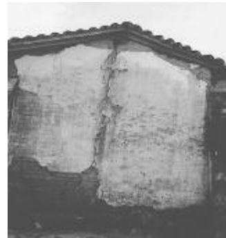
Figure 4. Flexural failure provoked by the roof system.

The adobe quality in the town of Ometepec is very good, in comparison with those qualities reported in other communities, the adobe walls were covered in order to resist the weather, and the adobe bricks presented natural fibers inside of them, which led to good behavior.