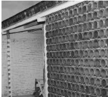
Figure 7. Outward failure of walls due to inadequate connection.

The reinforced concrete structures of the epicentral region were found in the town of Ometepec, and only three of them were reported with slight damage. The damages were provoked because of the poor structural configuration, such as short columns, or inadequate position of structural elements, (figure 8).