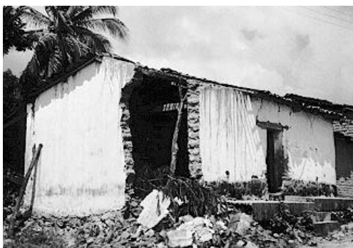
Figure 1. Outward failure of walls due to inadequate connection of corner walls.