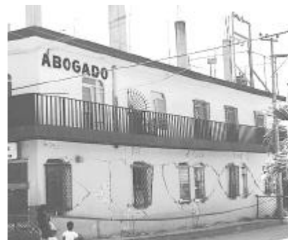
Figure 10. Stress concentrations at the corners of windows.

A poor response also resulted from inappropriate connection between stories, (figures 11 and 12), generally in old houses where a second story was added to an older pre-existing single story house, damages were found in the second story. In these cases, the first story was often made of unreinforced masonry walls, usually exhibited inadequate anchorage and overlapping of the longitudinal bars of castillos and dalas of the second story.