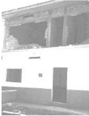
Figure 11. Inadequate connection between stories.

Although this construction type has proved to have good seismic behavior when it is properly designed, the lack of good engineering and quality control resulted in some cases in poor seismic response, as reflected by the diagonal cracking of the walls in some of these structures.