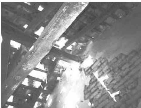
Figure 9. Flexural failure provoked by the roof system.

The most common type of residential construction in this epicentral region is a non-engineered self-constructed unreinforced brick masonry house. Most of the unreinforced masonry structures have load-bearing walls made of baked clay bricks. The oldest houses have 40 cm thick brick walls with mud commonly used as mortar, in contrast with newer houses with standard size bricks and cement mortar. Four typical types of failure were observed in both old and new structures, these failures are just alike as those described in the Ometepec earthquake.