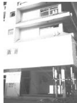
Figure 24. Weak first story failure.