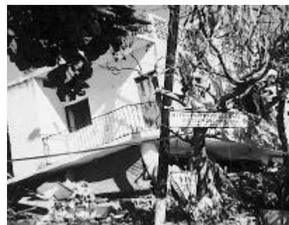
Figure 14. Weak first story failure.