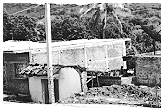
Figure 6. Reinforced masonry structure.