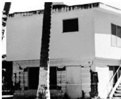
Figure 15. Weak first story failure.