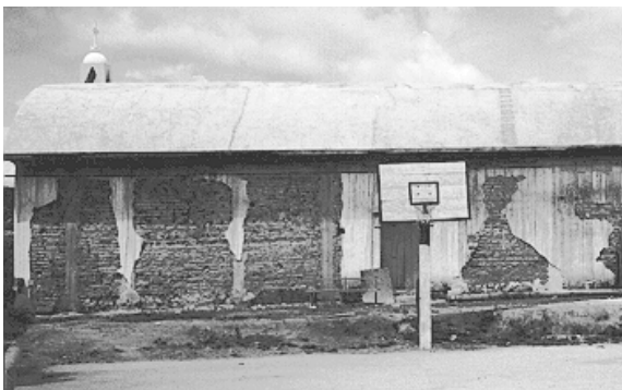
Figure 5. Reinforced adobe wall structure.

In this epicentral region of Guerrero there are few structures having vertical and horizontal elements that improve the seismic behavior of these adobe structures. These reinforcing elements are made of wood or concrete, (called dalas and castillos). This region of Guerrero has an important seismic activity, and therefore the adobe structures have been retrofitted and reinforced with those elements, some of the adobe structures were reinforced before the Ometepec earthquake, (figure 5).