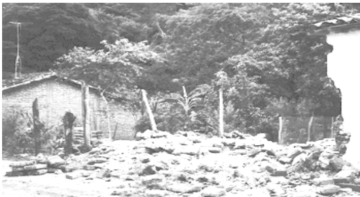
Figure 23. Reinforced masonry structures with no damage.

In general these structures performed well during the earthquake, but some of them were reported as damage. The poor seismic behavior was because the lack of engineering advice, and these two problems were detected: short columns with inadequate stirrup spacing, (figure 25); and inadequate disposal of longitudinal bars, package of bars with inadequate stirrup spacing, (figure 26). No damages were reported on steel structures.