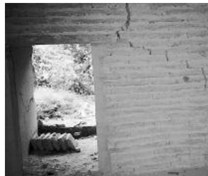
Figure 2. Stress concentration at the corners of doors and windows.