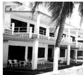
Figure 16. Adequate design procedures led to good seismic behavior.