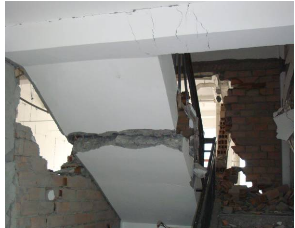
Figure.2.12 Fracture of a stair slab