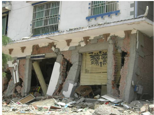
Figure.2.4 Damages of a bottom-frame building