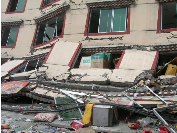
Figure.2.1 Collapse of a masonry structure building

basically whole. And the main majority of housings were whole or only minor damaged, however, the walls of some of old brick houses were damaged, tiles of large slope roof dropped, Cubby or small chimney on the top of buildings were damaged or collapsed.