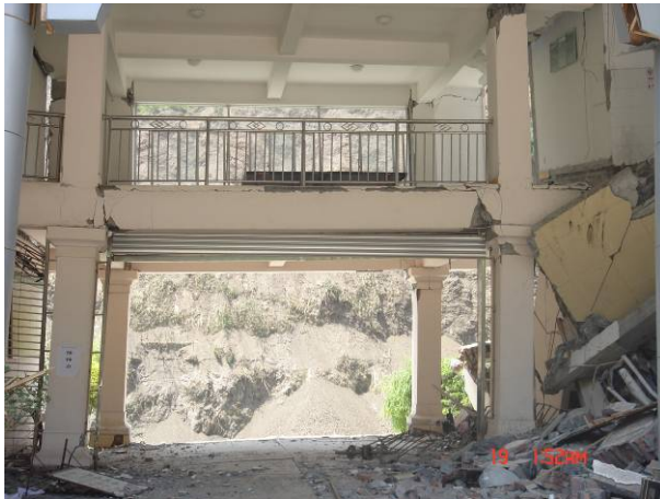
Figure.2.11 Damages of the ends of a beam