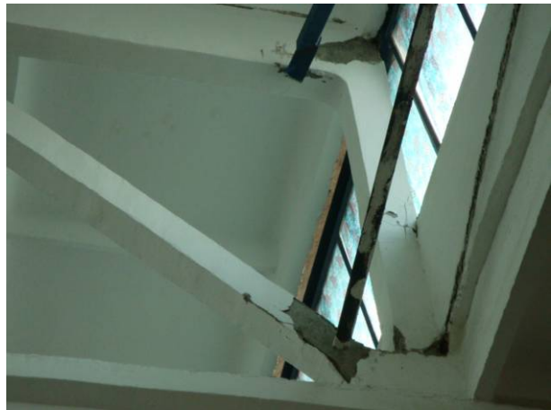
Figure.16 Damage of skylight truss