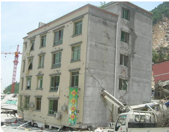
Figure.2.3 Collapse of bottom of a bottom-frame building