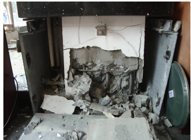
Figure.2.10 Damage of the bottom end of a column

The characteristics of damage varied with the intensity of the earthquake. Firstly, in the high-intensity area, the frame structures suffered moderate to severe damage and even collapse. The major damage occurred in end column or joints, including the concrete being crushed and the reinforcement yielding seriously in end column or joints. After the joint was damaged, the horizontal cracking and dislocation occurred in end column. Serious shear cracks of filler walls made the structure damage seriously or partially collapsed. Secondly, in medium intensity area, frame structures suffered minor damage or moderate damage. Major damage that structures suffer included horizontal cracks of end column, vertical cracks and cracks of beam end, slightly crushing of the concrete at the joints, slightly curving of steel, and lots of shearing diagonal cracks in filler walls. Thirdly, in the low-intensity, the frame structures were basically well. The brick filler walls were well mostly, only a few was damaged slightly.