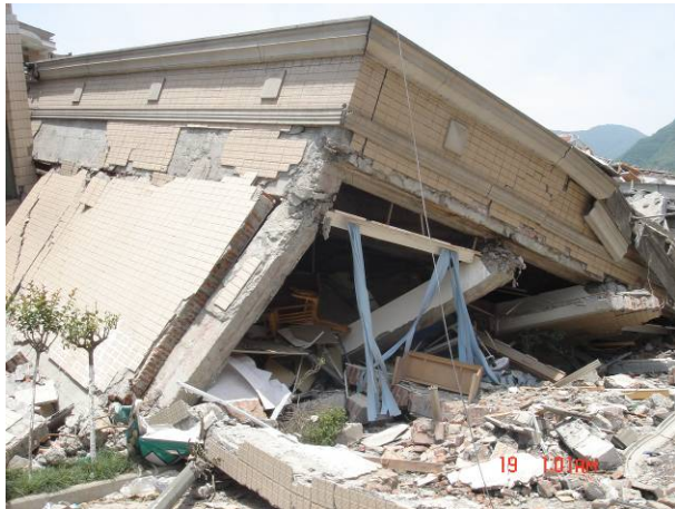
Figure.2.7 Collapse of a frame structure building

Comparatively reinforced concrete structures had better seismic performance, but in the meizoseismal area, the reinforced concrete frame structures collapsed and were damaged seriously, and, in the medium-low intensity areas, the damage was relatively minor. For multi-story reinforced concrete structures, the damage mainly occurred in the frame column and in filler walls, and the most serious damage occurred in the end of the column and in the beam-column joints, however, the secondary beam and floor were often less damaged.