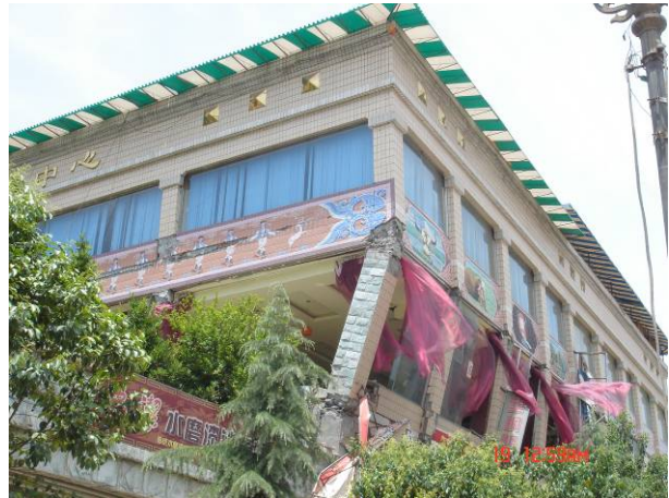
Figure.2.8 Damages of the corner column