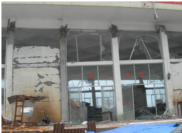
Figure.2.9 Damages of the top end of columns