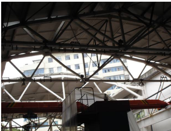
Figure.2.13 Collapse of precast reinforced concreter roof

Genarelly, there are severl structure types of industrial buildings such as reinforced concrete column workshop, with precast reinforced concrete roof or lightweight steel roof, and steel structure workshop. Comparatively speaking, the damage of steel structure workshop is more lightly than reinforced concrete column workshop, the damage of workshop with lightweight steel roof is more lightly than precast reinforced concrete roof. The seismic damage of the industrial buildings in high intensity region are mainly including destruction of roof and collapse of the maintenance wall. While there were few pillars collapsed, but seriously damaged at upper stair column. The seismic damage in lower intensity region are maily failure of maintenance wall or damage of skylight truss.