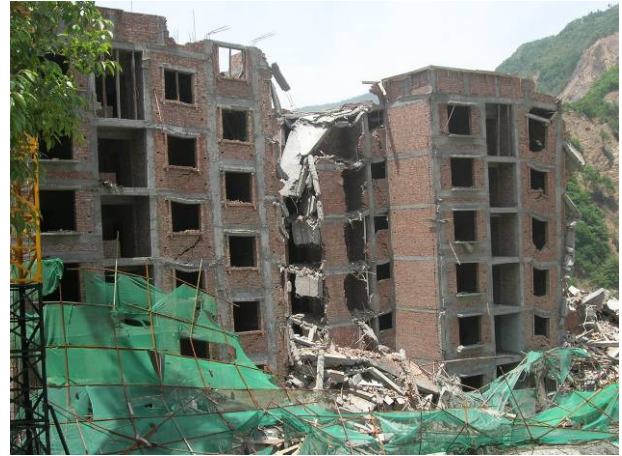
Figure.2.2 Collapse of a masonry structure building