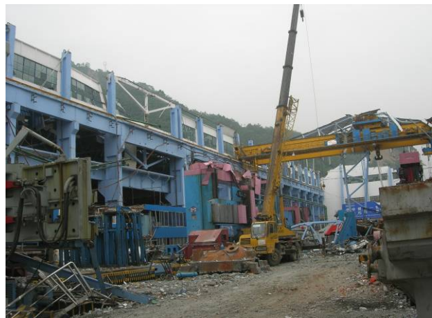
Fig.2.14 Collapse of lightweight steel roof