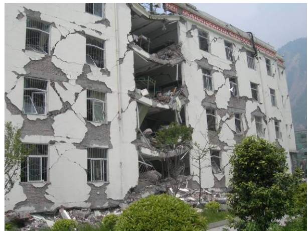
Figure.2.6 Collapse and damage of exterior lengthways wall of a masonry structure building