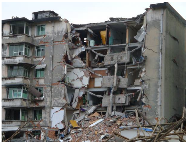
Figure.2.5 Collapse of exterior lengthways wall of a masonry structure building