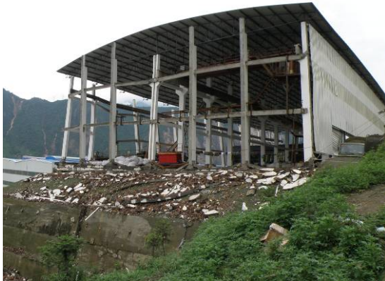
Figure.15 Collapse of the maintenance wall