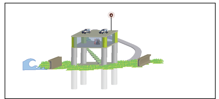
Figure 3. Schematic Design of Tsunami Evacuation Building (TEB)

Figure 3 is a schematic design of a hypothetical two story concrete TEB with deep foundations and rooftop parking. Floor 1 includes a tsunami education center and other community functions, which would be sacrificed during a tsunami. Floor 2 includes office space and is elevated above the tsunami inundation elevation. The top floor is for parking, emergency supply storage, and has a readily identifiable TEB beacon and siren for evacuees. Two vehicular ramps and two staircases, which are located away from the ocean, allow for mass emergency ingress including wheelchair access.