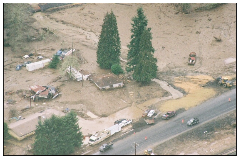
Figure 2. Debris Flow Fan that Inundated a Community and Lifelines

Woodson, Midland, Marshland, and the Clatskanie area experienced flooding and mudslides. The small community of Woodson, which is located on state highway 30, was severely damaged from a debris flow, a fast moving, water-ladened, landslide. Figure 2 shows the debris flow fan, which engulfed the community, state highway 30, the railway, and several lifelines, before entering the Columbia River. The photo shows the highway after the debris was removed. Approximately 50 km of state highway 30 are at risk from channel scour, debris flows and landslides from the adjacent hills to the south in Columbia and Clatsop Counties.