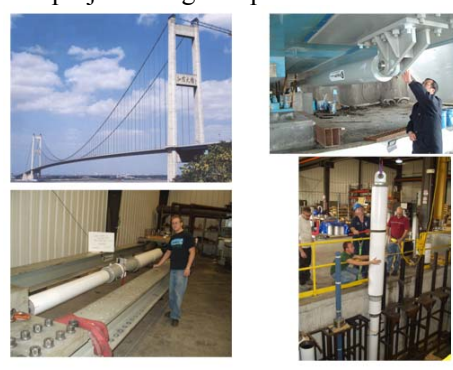
Fig 5 Jiangyin Yangtze River Bridge and dampers

The China Highway Planning and Design Institute analyzed the structure under seismic, wind and traffic load conditions. Four dampers with 1000 kN and large damper's stroke \pm 1000 \text{mm} are useful in reducing the vibration. This is the first bridge retrofit project using damper devices in China.