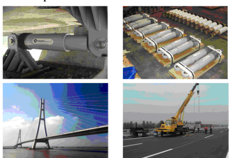
Fig. 1 Nanjing Yangtze river 3<sup>rd</sup> bridge and 54 dampers

<u>Nanjing 3<sup>rd</sup> Yangtze River bridge</u>, Taylor Devices' dampers are not utilized for the main span of this 1000m cable stayed bridge. 54 sets of 1500kN dampers were installed at the approach bridge which connects the piers and the beams of the bridge. The dampers distribute and transfer the force to the more connected piers and also reduce the pier shear force during an earthquake.