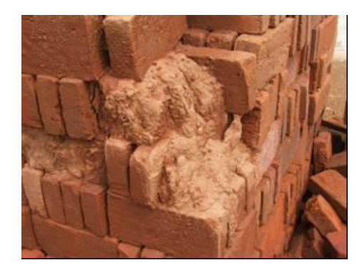
Figure 5 Melting bricks