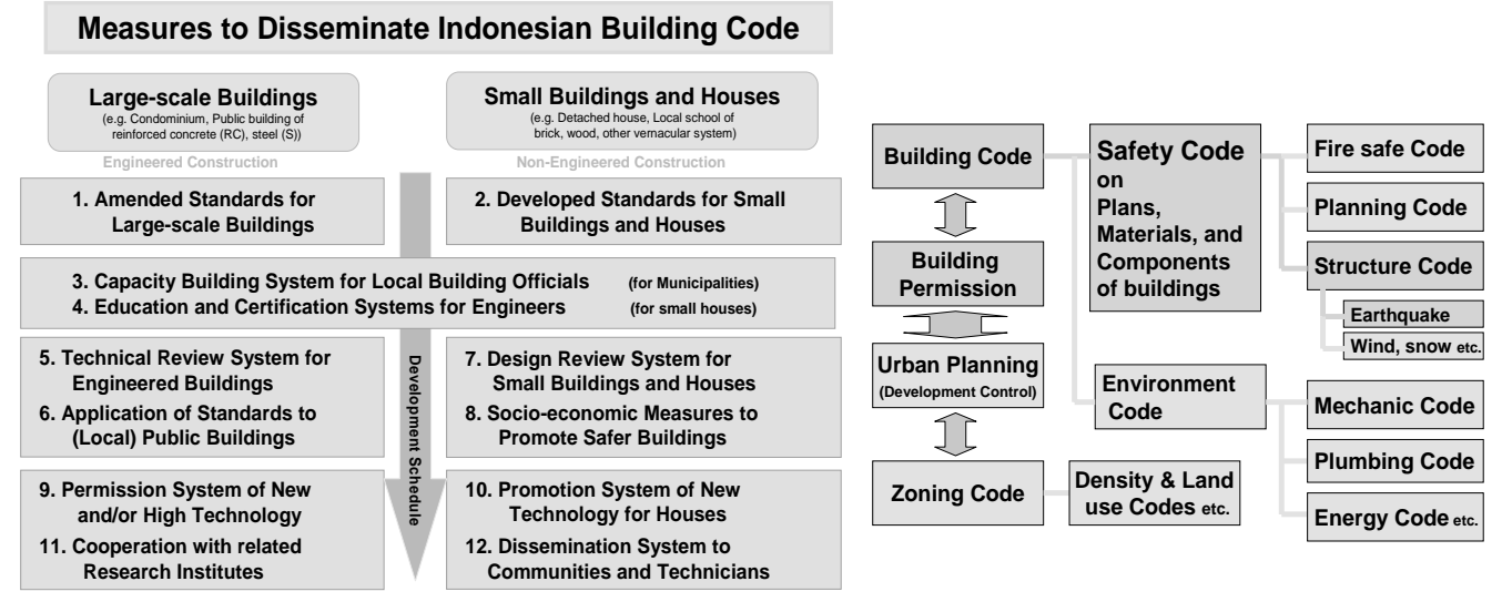
Fig. 6 Proposed measures to disseminate Indonesian building codes