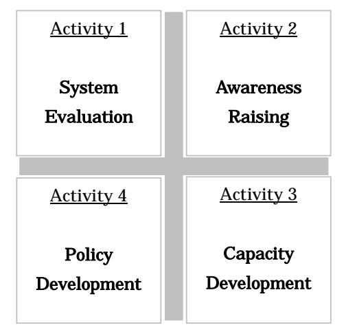
2 - 2 Activities

The HESI project consists of four core activities: 1) system evaluation, 2) awareness raising, 3) policy development, and 4) capacity development (Fig. 2). The first activity aims to collect information relating to housing safety from the perspective of building code implementation. The second activity aims to raise awareness among stakeholders of housing safety, including officials from national governments and local governments, building professionals and house owners on the code as a tool to ensure the safety of house as well as the need to construct houses according to the code. The third activity aims to develop policies to disseminate building code more effectively within local governments, building professionals and communities. The fourth activity aims to develop capacity of government officials, engineers and technicians involved in housing construction in their roles to enforce the code.