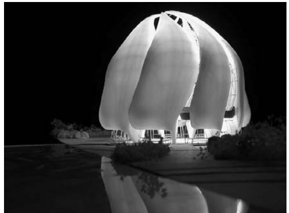
Figure 3: Baha'i Temple in Chile (in progress)

New technology-based seismic protection methods are very recent. The original idea was conceived a long time ago, but, in those days, it was impossible perform it. Nowadays, thanks to new materials and technologies, buildings can be provided with base isolation which separates the building from the ground movement and absorbs earthquake energy. Thus, the structure that lies on the isolators avoids severe damages. An earthquake measuring 8 on the Richter scale can be perceived as 5.5. The damage level caused by one or the other is drastically different.