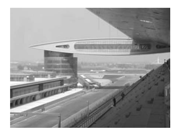
Figure 2: Shangai Circuit, China

Most buildings having base isolation have been rehabilitated, that is, they were subjected to this seismic protection method for preservation purposes. The results achieved have been positive.