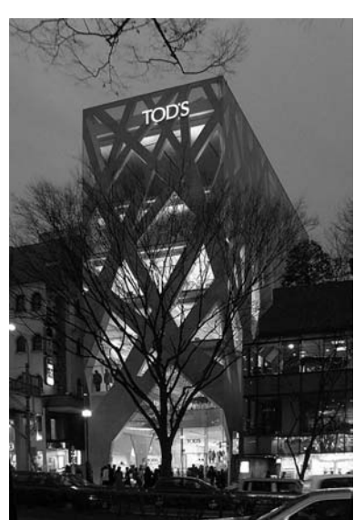
Figure 1: Tod's Otomesando, Japan

Architecture has incorporated this new damage reducing technology into its design stages. See Figure 1 and 2