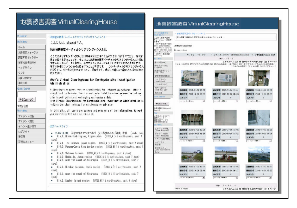
Figure 1 Screen shot of prototype Virtual Clearinghouse

An additional problem for development of a risk analysis the loss of valuable data on natural and technological disasters, collected by disparate investigators and organizations. Experience shows these data are typically lost after a very short period, because of the lack of a central, standardized archive. The author has proposed development of a Natural Emergency Experience Database (NEED) to address this need.