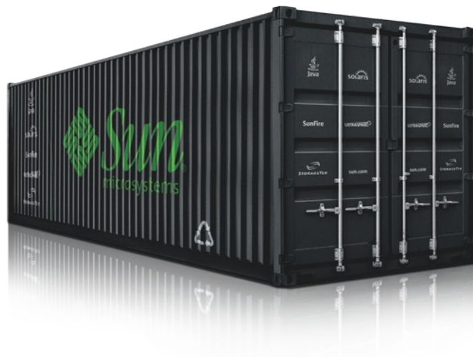
Figure 1 – Mobile Data Centre for Rural Deployment

Modern networking has freed the data centre from being tied to office space. The mobile green data centres can be wheeled into car parks, buried underground, put onto ships and cooled by the ocean plus many other out of the box thinking deployments. Thus the data centre has become here a single device and not a facility which is a key status quo change. This has huge implications on the environment and on microfinance disaster risk mitigation. In order to transport our solution the whole device is housed in the size of a normal shipping container so it can be easily transported to rural areas. Sensors in the device check and alert for soil movements, excessive temperature, high humidity, unauthorized entrance, smoke/fire, water leaks and unauthorised transport plus many other activities matching the field deployment at hand. Also the payloads are recycled for the environment. Figure 1 shows an external view of such a device. .To achieve the solution we have to address the last mile.