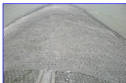
Fig.4 small cracks of (2-3) cm on the Dujiangyan weir surface