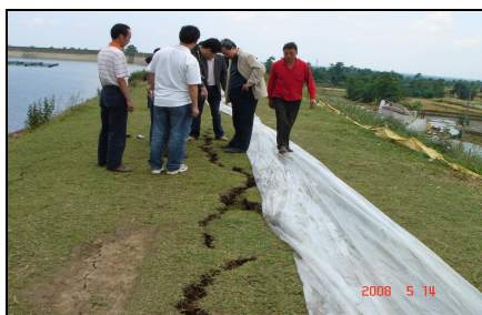
Fig.3 Damaged small dam with crest cracking

The Three Gorges Project and the high Ertan arch dam (H=240 m) have no impact from the quake, as they are located several hundred kilometers away from the meizoseismal area.