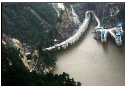
Fig.7 Aerial photo of Saipai dam

Saipai dam of 130 m high completed in 2006 is the world's highest RCC arch dam at that time. The dam is a three-center gravity arch structure having a crest length of 250.25m. It is 9.5m thick at the crest and 28m at the base. The dam is located 30km away from the epicenter and the reservoir kept its normal water level of 1866.0m during the quake. There are two contraction joints and two induced joints along the arch direction. The dam is founded on granite and granodiorite formations making up the relatively steep-walled and V shaped canyon. The dam abutments are supported by rock mass of class II without continued plane of weakness. The seismic design of the dam has been carried out with a design peak acceleration of 0.138g corresponding to a return period of about 500 years based on a special seismic hazard analysis for the dam site. The dynamic responses of the dam were checked both by dynamic trial method and finite element method. The dam site is still not accessible due to the road blockage by the landslides so far. However, base on the aerial photo and report from individual investigator entered by walking, it revealed that the dam including its anchored abutments is stable without evident damages (Figs.7-8). But the power plant has been inundated due to the collapse of the partial penstock being across the river.