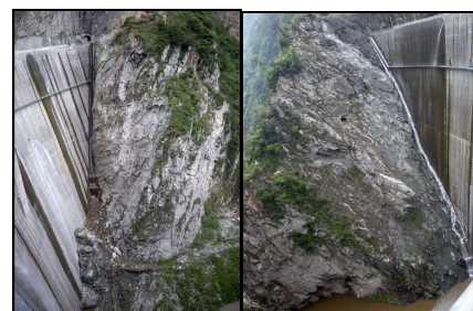
Fig.8 Left and right abutment of Saipai dam