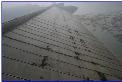
Fig.5 Damages of face slabs