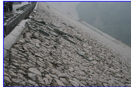
Fig.6 damages of downstream slope protection

The concrete slabs and the peripheral joints were slightly deformed. But after the shock an anomaly share deflection up to 104.24 mm at the base of canyon has been detected, however, the malfunction of the transducer can not be excluded so far. As the change of seepage is only ranging from 10.38l/s before the shock to 15.07l/s after the shock. It seems that even if the sealing copper sheet might be damaged, the surface water stop system including the clay overburden still keeps in normal order. Some parapet walls and banisters at crest were collapsed