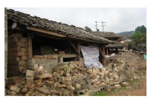
Figure 3. Partial collapse of residential house in Pu'er earthquake

On the basis of summarizing the recent earthquake damages to villages and towns, it is concluded that the phenomenon of "small earthquake caused heavy disaster" is rather serious and common in these regions. In recent years, hazardous earthquakes frequently occurred in China, especially in undeveloped central and wester n regions. However, due to the limitation of low levels of local economy, there are many problems existed in the construction of earthquake prevention and disaster mitigation in villages and towns. They consist of the following aspects: 1) Most of local buildings are not well designed for good anti-seismic ability. 2) Infrastructure construction is rather weak. 3) Capacity of social defense to earthquake is obviously inadequate . 4)