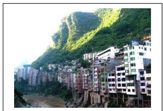
Figure 2. The houses built in foothill and riverside in Yanjin