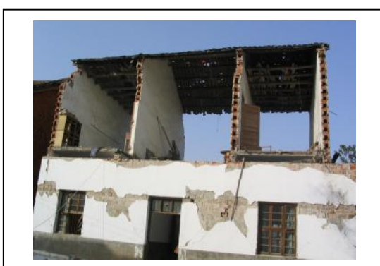
Figure 1. Residential house was destroyed in Jiujiang earthquake

According to statistics, there have been about 250 earthquakes of M s 5 occurred in mainland of China since 1996, of which about 127 earthquakes caused disaster. Meanwhile, the overwhelming majority of the hazardous earthquakes occurred in the western areas with underdeveloped economy, such as Yunnan, Xinjiang, Sichuan, Tibet and Gansu, etc. Especially in 2003, there were 21 earthquake disasters occurred in mainland of China in the whole year, with their epicenters all falling into the villages and towns. Actually, since 2001, there are about 11 destructive earthquakes with heavy disaster came about in China . Among them, the author's research team conducted the field investigations to 2005 earthquake in Jiangxi Jiujiang, 2006 earthquake in Yunnan Yanjin and 2007 earthquake in Yunnan Pu'er [4-8], as shown in Fig. 1-3.