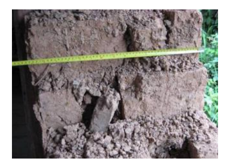
Figure 6. The earth wall with thickness of half meter

Overall, there are many problems existed in aseismic capacity of countryside houses: 1) As constructed conveniently with simple plane arrangement, the houses are always not conductive to seismic in the pattern. 2) As constructed according to local conditions, the houses are of low cost with poor quality of building materials. 3) Villagers usually pay too much attention to the outward appearance, decoration and artistic style, while ignore reasonable structure pattern and earthquake resistant capability. 4) The houses which lack the overall construction plan and earthquake protective measures are common in villages and towns. 5) The seismic capacity of the houses is relatively low, with poor integral behavior of seismic structure and many weak links in earthquake resistance.