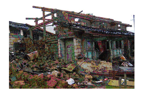
Figure 4. The house was destroyed in Pu'er earthquake