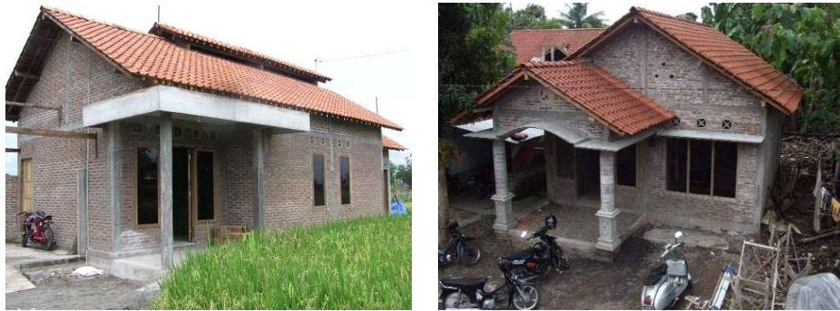
Figure 7 Good masonry houses with heavy canopy.

Construction materials may contribute to the vulnerability of the structures. From the procurement aspect, the lack of availability of qualified construction materials sometimes leads to substitution using any available resources. In the case of Aceh, poorly graded sand and gravels coming directly from the river are often used as concrete aggregates. The use of plain rebars for longitudinal and transversal reinforcement are common, whereas Indonesian seismic code clearly states that plain rebars can only be used for spirals and tendons. The size of rebars used is also a typical problem. Although minimum dia. 12 mm of deformed bar for column longitudinal reinforcements, dia. 10 mm of deformed bar for beam longitudinal reinforcements, and dia. 8 mm plain bar for stirrups are specified in the Indonesian concrete code, smaller diameter bars are often found in practice. Non standardized brick size and quality add problem to the vulnerability of masonry buildings (see Figure 8).