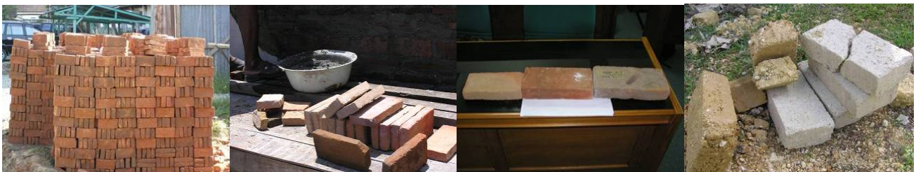
Figure 8 Different types of local bricks

Construction materials may contribute to the vulnerability of the structures. From the procurement aspect, the lack of availability of qualified construction materials sometimes leads to substitution using any available resources. In the case of Aceh, poorly graded sand and gravels coming directly from the river are often used as concrete aggregates. The use of plain rebars for longitudinal and transversal reinforcement are common, whereas Indonesian seismic code clearly states that plain rebars can only be used for spirals and tendons. The size of rebars used is also a typical problem. Although minimum dia. 12 mm of deformed bar for column longitudinal reinforcements, dia. 10 mm of deformed bar for beam longitudinal reinforcements, and dia. 8 mm plain bar for stirrups are specified in the Indonesian concrete code, smaller diameter bars are often found in practice. Non standardized brick size and quality add problem to the vulnerability of masonry buildings (see Figure 8).