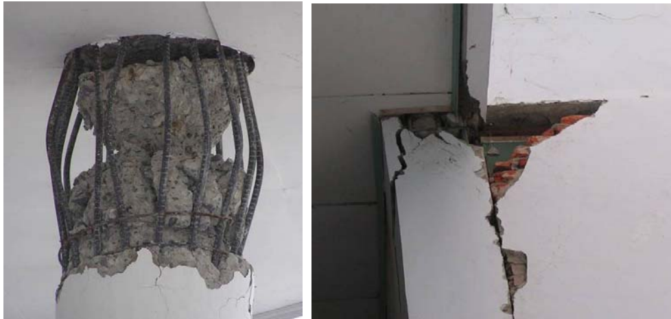
Figure 3. Failed elements and connections.