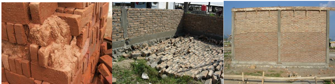
Figure 9. Poor material quality and workmanship, variation of brick quality found in Aceh reconstruction.

In the post recovery efforts, the problems in material aspects are related to the high demand and short supply situation. For instance, 'half-baked' bricks were found to be used in the construction in Aceh. These bricks were poorly built and fell below the minimum strength level of bricks, showed by their inability to be tested for their strength and 'melt' if soaked with water (Figure 9). Another typical problem found was the quality of the concrete mixture. The gradation of aggregates did not comply with the standard material gradation used for concrete mixture. Large aggregates were found in the mixture. Sand was not washed thus silt or clay could be mixed with it, leading to a very poor mixture. Moreover, excessive amount of water also used in the concrete mixture for higher workability, which leads to high water content and low strength concrete.