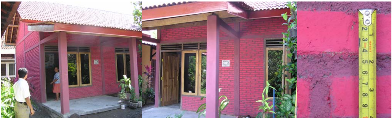
Figure 10. BARRATAGA model houses with adequate structural components and proper brick layering.

masons and built model houses (Sarwidi, 2007). The trained masons were then served as trainers for other masons, thus the concept and knowledge of earthquake resistant structure can be widely spread among the workers.