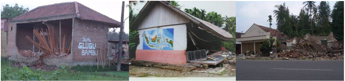
Figure 5. Damages in non-engineered buildings