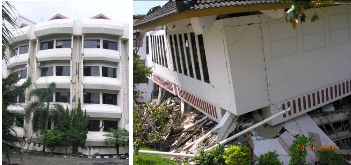
Figure 2. Soft story and weak story effects causing total collapse of structures