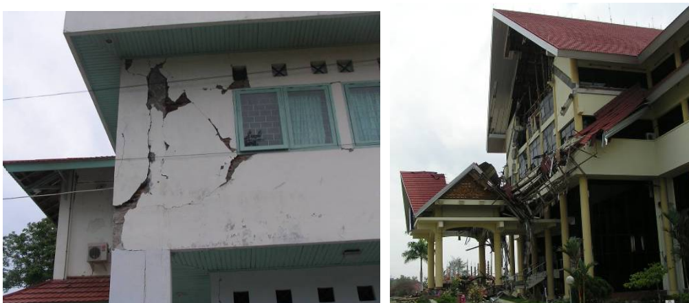
Figure 4. Failed elements and connections.

Figure 5 shows damages occurred on non-engineered structures. These damages usually caused by improper detailing and lack of structural integrity of various components in the building. These problems created separations of structural elements and partial collapse, or total collapse. Most damage occurred on the walls, as these elements were often left unconnected to beams and columns.