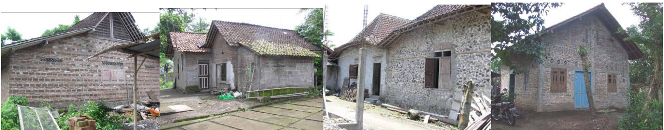
Figure 6 Non-engineered ordinary houses in Indonesia.

Non-engineered structures face many problems during earthquake in Indonesia. Many of these structures have been evolving from vernacular buildings, which used to have good performance in earthquake, toward more common masonry structures such as those found in urban areas. These structures often do not follow minimum requirements for a good confined masonry building, and many of them use locally available materials to give a “masonry-like” features, which are in fact very vulnerable to ground shaking (Boen and Pribadi, 2007). Typical non engineered structures in Indonesia using different types of materials are shown in Figure 6. The picture on the far right shows non engineered structure with good feature of confined masonry.