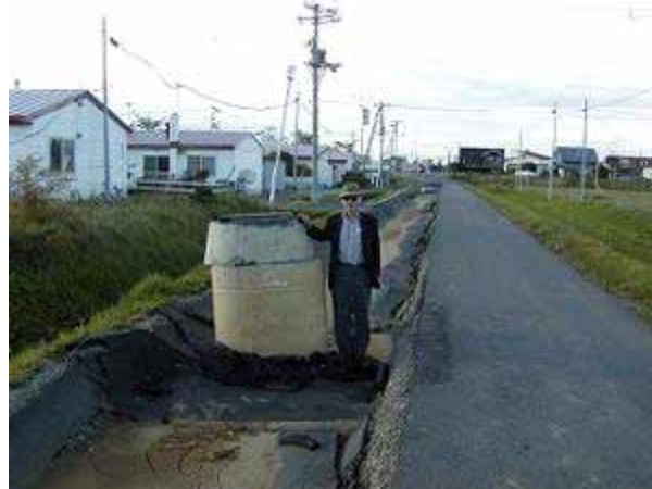
Fig.4 The float-up of the manhole, Tokachi-oki earthquake (M8.0) Japan, 2003

It seems that the basement of the bridge pier is not good. The blown sand and sand volcano appear in front of the pier. It is recognized that this phenomenon also progressed very slowly.