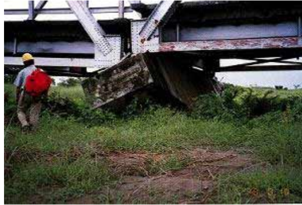
Fig.3 The bridge pier sank down by the ground liquefaction, Luzon earthquake (M7.8) Philippines, 1990

It seems that the basement of the bridge pier is not good. The blown sand and sand volcano appear in front of the pier. It is recognized that this phenomenon also progressed very slowly.