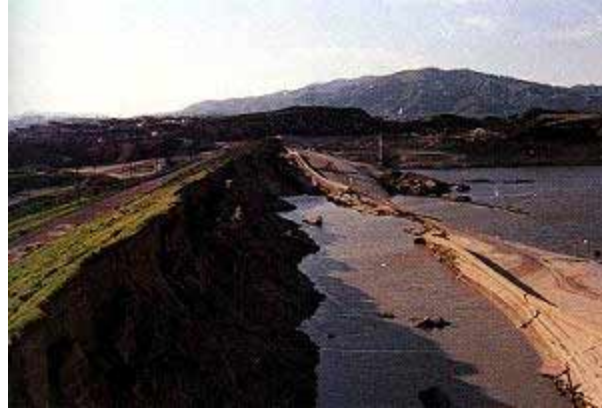
Fig.5 Liquefied Van-Norman earth-dam, San Fernando earthquake (M6.5) USA, 1971

The collapse of the dam was caused by liquefaction under the water in the reservoir. The dam was not completely collapsed, therefore, the water of the reservoir did not go downstream fortunately. Many people live downstream of the dam, therefore, if the dam was completely collapsed and much water of the reservoir had come down the residential area, then they would be suffered the catastrophe.