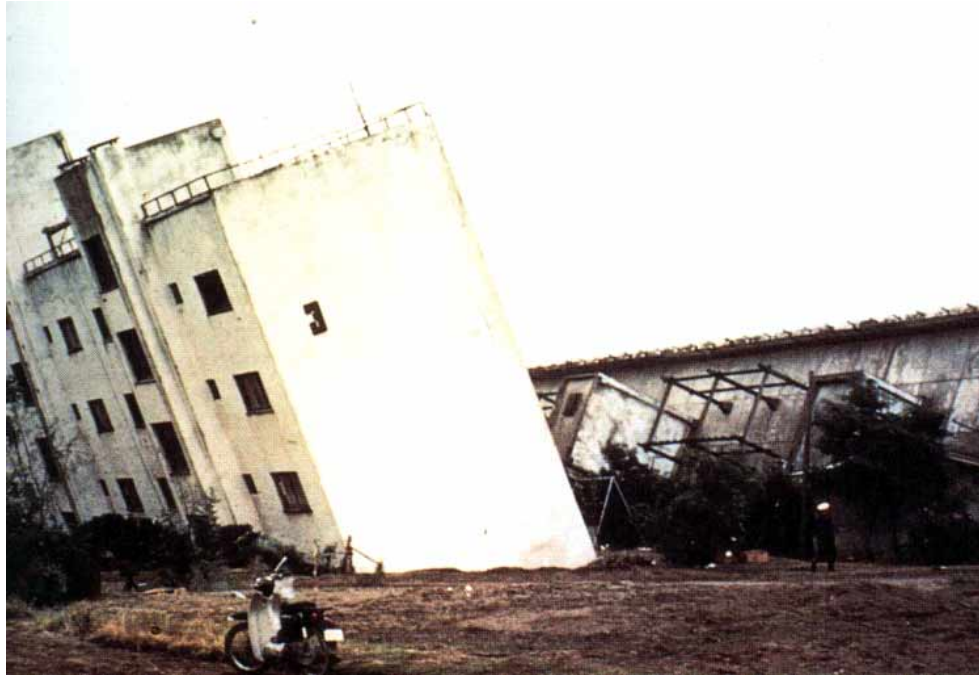
Fig.2 Tilted RC apartment house by the liquefaction, Niigata earthquake (M7.5) Japan, 1964

In case of ground liquefaction, the rapid destruction of the structure by the intense horizontal vibration is not generated, because the most of S wave does not reach the surface. Although the vertical ground motion (P wave) is amplified in the ground surface layer, its duration is short and does not give a serious damage on the structure. Then, the destruction of structure due to liquefaction will be the slow fracture such as inclination, subsidence, floatation, etc..