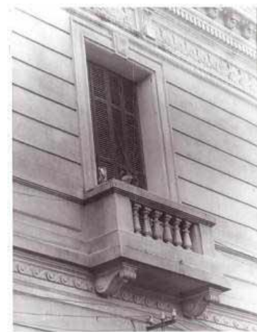
fig N° 5

The architectural ornaments, moldings, balustrades and other details are made of iron and mortar. Bricks are believed to have been locally produced, but the rest of the materials were imported from Europe, since concrete was still unknown by the native constructors of the time (fig N° 6).