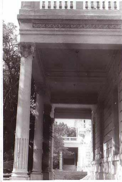
Lateral front gallery