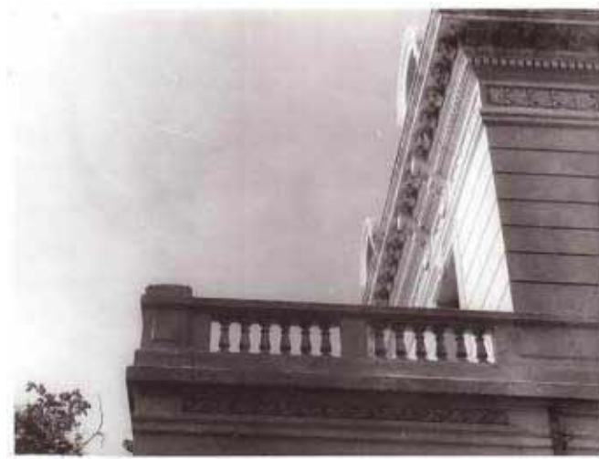
fig N° 6