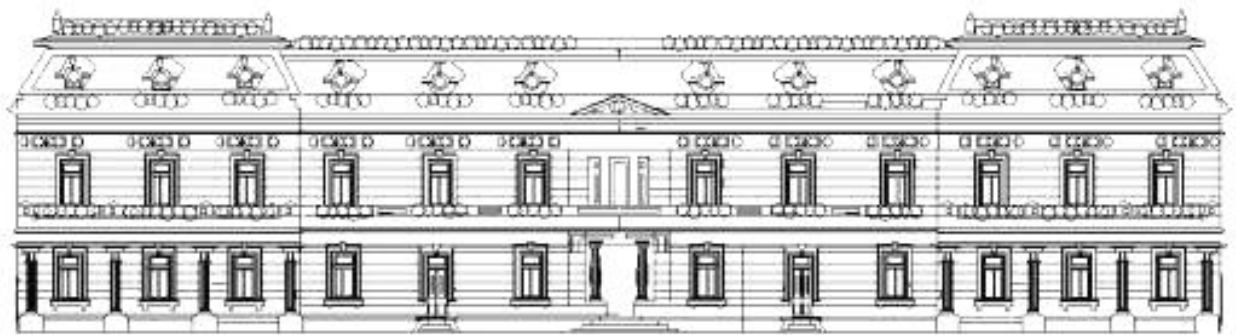
fig N° 1