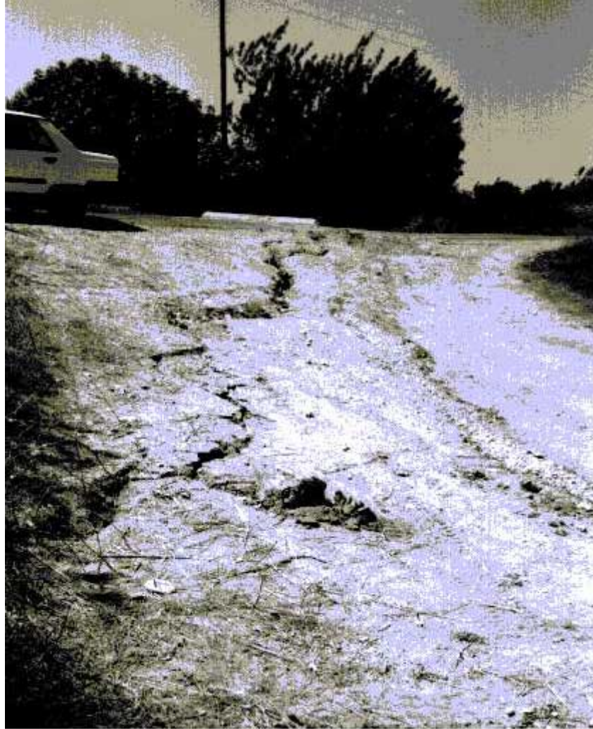
Figure 3: Part of a seismic rupture caused by sinistral strike slip movement.