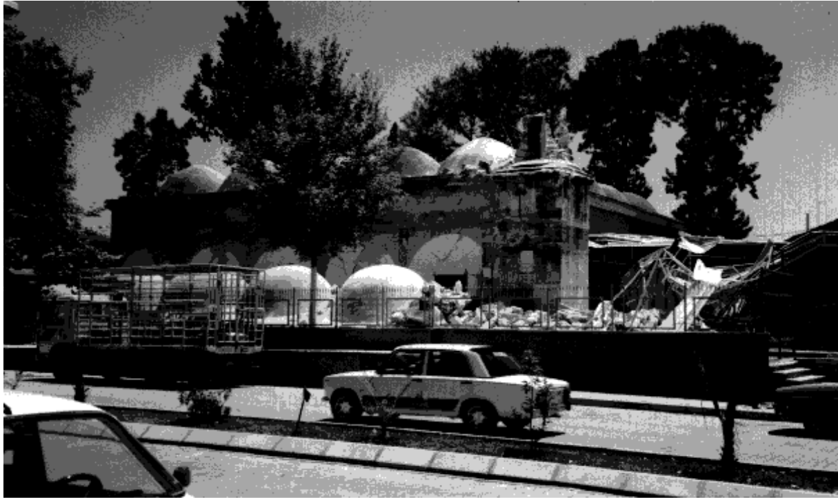
Figure 5: Partially collapsed mosque in the city of Ceyhan.

Significant damages were also observed in the historic monuments of the area and mostly in mosques and minarets (Figure 5). These damages showed a selective development in the upper parts of the minarets [Lekkas and Vassilakis, 1999]. Additionally in the vicinity of the villages Yakapinar-Abdioglu, some industrial buildings with metal framework suffered significant damages.