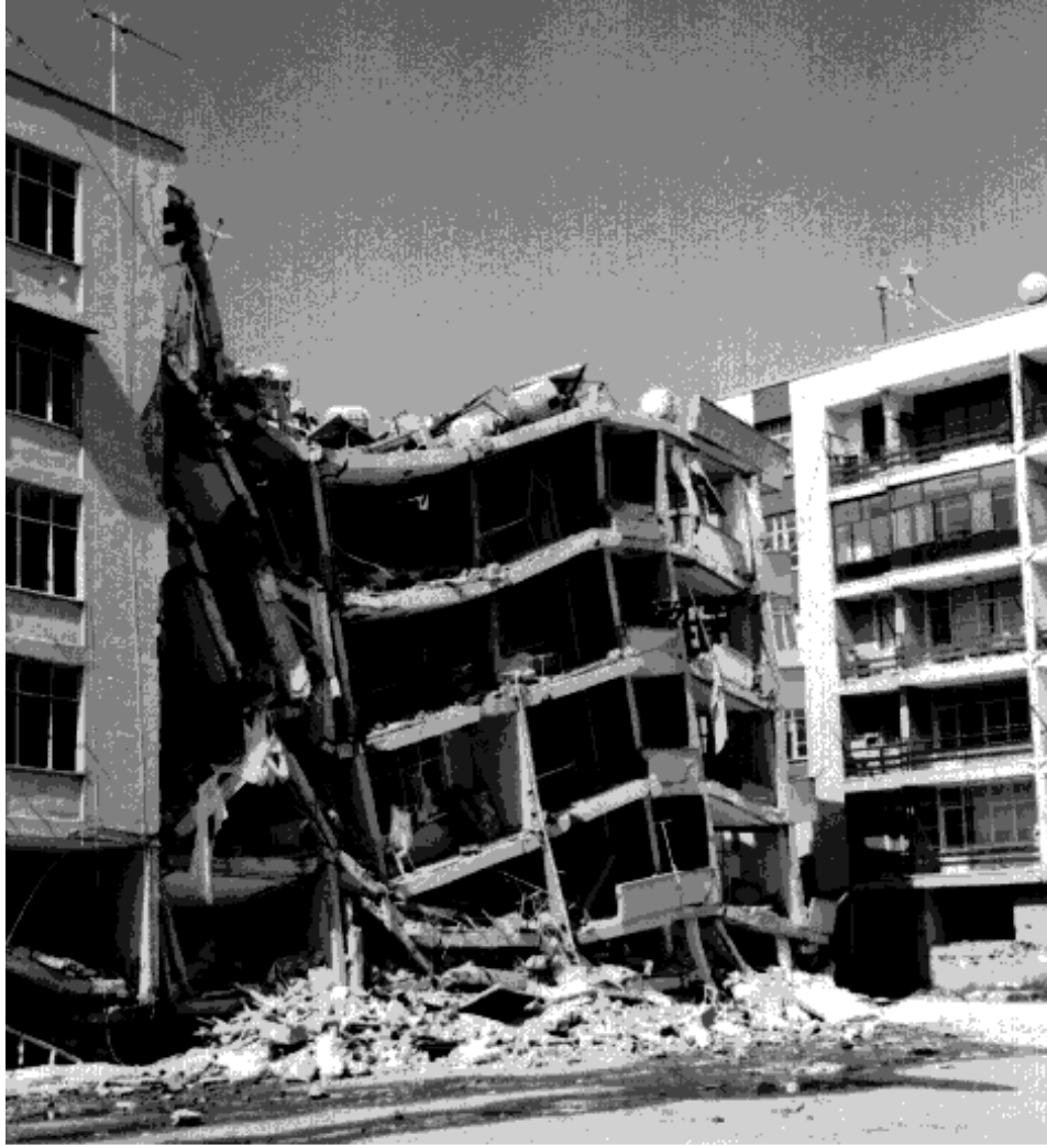
Figure 6: Partially collapsed building, due to the succession of flexible and rigid structural elements.

Finally based on the research of damage development, it was concluded that the area of damage development is strictly constrained from Adana to Ceyhan in a NE-SW direction. This is the direct result of the type of earthquake, of the direction of the fault that yielded the seismic event and of the seismotectonic framework in general.