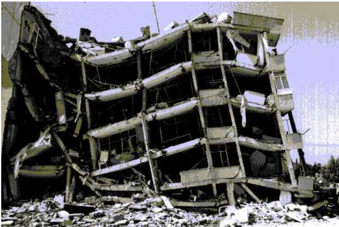
Figure 4: Total collapse of multi-story building at the city of Ceyhan.

The most substantial damages occurred in buildings of the first four categories mainly in villages where at least 30%-80% of the structures suffered significant damage. Furthermore, significant damages occurred in multi-story buildings of reinforced concrete and without earthquake-design standards or with the quality of the materials significantly degraded. Such damages that led to total collapse occurred in the area of Adana and in the area of Ceyhan (Figure 4).