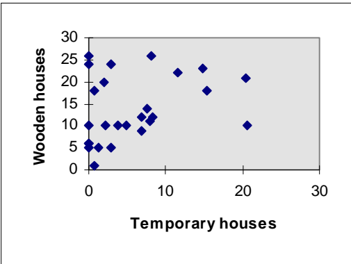
Figure 2: Correlation between temporary houses and wooden houses

The qualities of buildings and houses in the Bandung Municipality were obtained from a survey conducted at each district of the Bandung Municipality. The survey recorded conditions of each building evaluated. At every district of the municipality 100 buildings or houses were sampled at random, trying to pick them as representative samples. The number of samples was picked to be evenly distributed among subdistricts. This methodology, however does not necessarily exclude the possibility of subjective biases due to instant conditions such as facility, access, bureaucracy, security, or the notion that the survey should be intended to evaluate the vulnerability of the buildings and houses to earthquake.