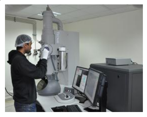
Advanced imaging facility

Advanced Imaging at IIT Kanpur was started with а generous internal grant from the Institute to procure high-resolution transmission electron for microscope researchers engaged cutting-edge materials research. The building microscopes, houses sample preparation and