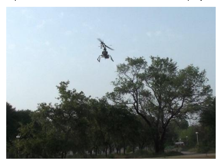
Demonstration of an autonomous mini-helicopter

SERB has funded a project titled Porphyrin Dimers as Model of Di-heme Proteins: Inorganic and Bioinorganic Perspectives and Consequences of Heme-Heme Interactions. The project aims