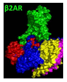
Superimposition of a GPCR-G protein complex and a GPCR arrestin protein complex

The project on the Structure, and novel signaling Function pathways of the Non-canonical G Coupled Protein Receptors (GPCRs) was sanctioned by the Wellcome Trust DRT Alliance. The major goal of this project is to visualize the three dimensional structure selected GPCRs at atomic resolution by Xcrystallography. Such ray