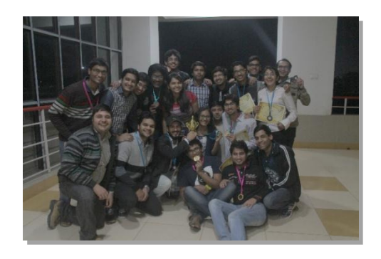
Students participating in inter-IIT Tech meet

At the recently concluded 3<sup>rd</sup> Inter IIT Tech Meet hosted by IIT Kharagpur, IIT Kanpur secured 2<sup>nd</sup> position in the overall tally. IIT Kanpur won 2 gold and 3 bronze medals in the meet which had 8 events encompassing technology, knowledge and application.