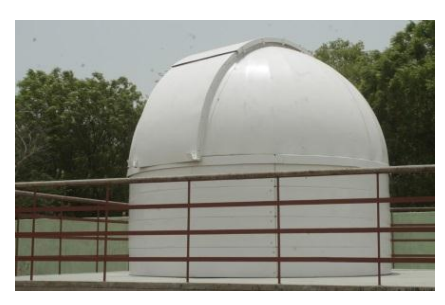
A view of newly acquired astronomical observatory

Our Institute has recently installed an amateur astronomical observatory. Schmidthosts а Cassegrain telescope with a 14-inch primary mirror and a CCD camera for Both the imaging. observatory dome and the telescope can be operated