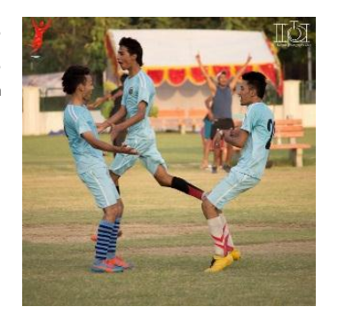
A scene from UDGHOSH

an Annual Sports UDGHOSH. Festival of IIT Kanpur was 25<sup>th</sup>-28<sup>th</sup> organized during September 2014. UDGHOSH '14 association with F-Cell in organized Ink talk which had an audience of more than a thousand. UDGHOSH'14 witnessed from plethora of events Gymnastic Motivational Talks, Shows and Sport Quizzes to