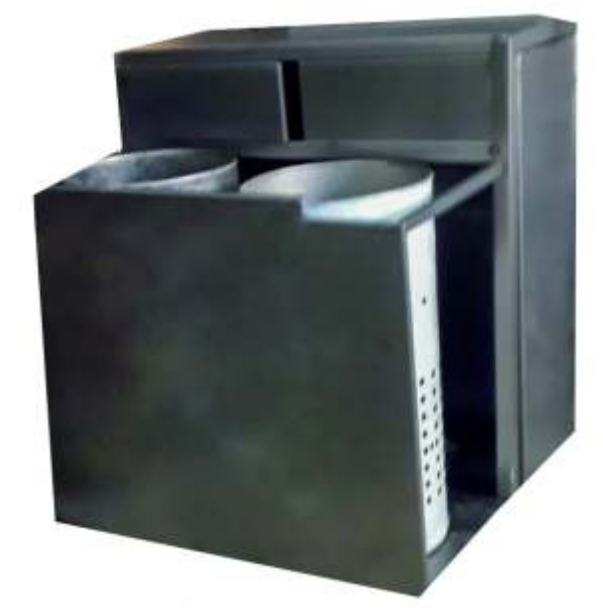
Image of a Under-construction piece for demonstration purpose only (not scaled)