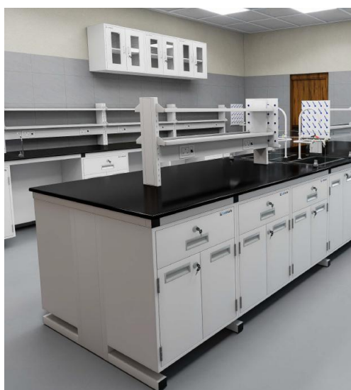
Plate -1: Representative photograph of Laboratory Working platforms/tables