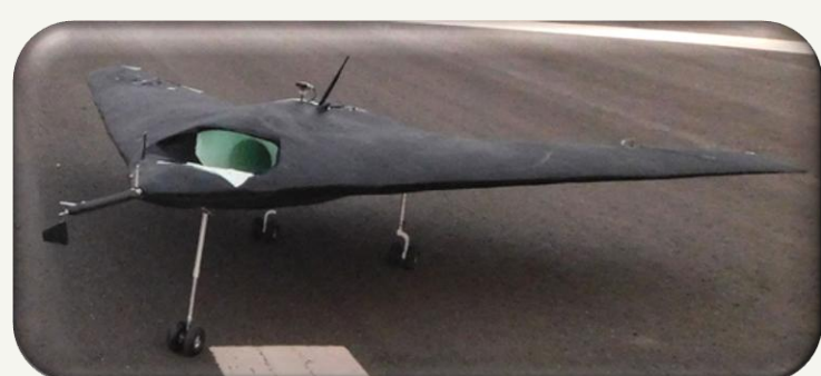
Flight Dynamics & Control