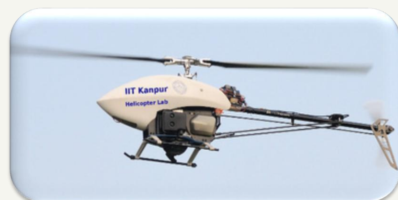
Structures & Aeroelasticity