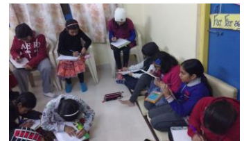
Snap shot of the Event