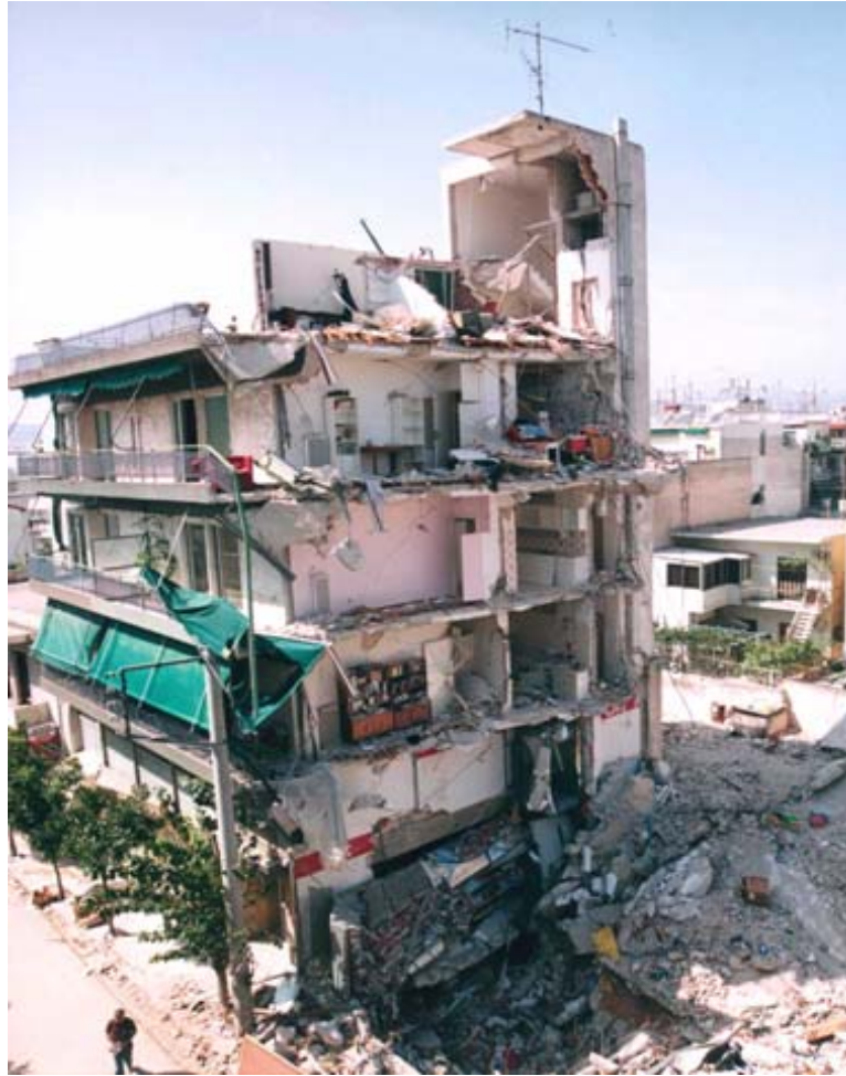
Figure 3.1. Damage index: “Collapse” of a building after the 7-9-1999 Parnitha’s earthquake (Karabinis, 1999).