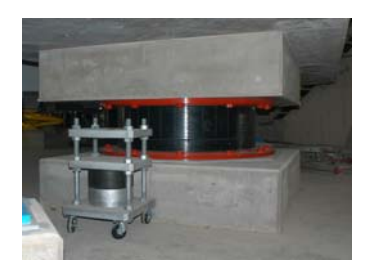
The large isolators are installed as 28 NRB, 1,500 mm diameter, with 15 SD, and 44 LD, MM Towers were designed by Mitsubishi Jisho Sekkei Inc.

Figure 2 High-rise condominiums with SI, MM towers, Yokohama city, Kanagawa prefecture