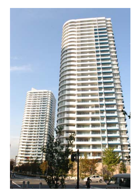
Figure 1 Kamikuzawa Condominiums in Sagamihara city, Kanagawa prefecture