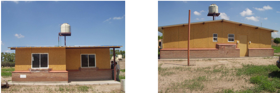
Figure 3: Prototype built for studying performance durability