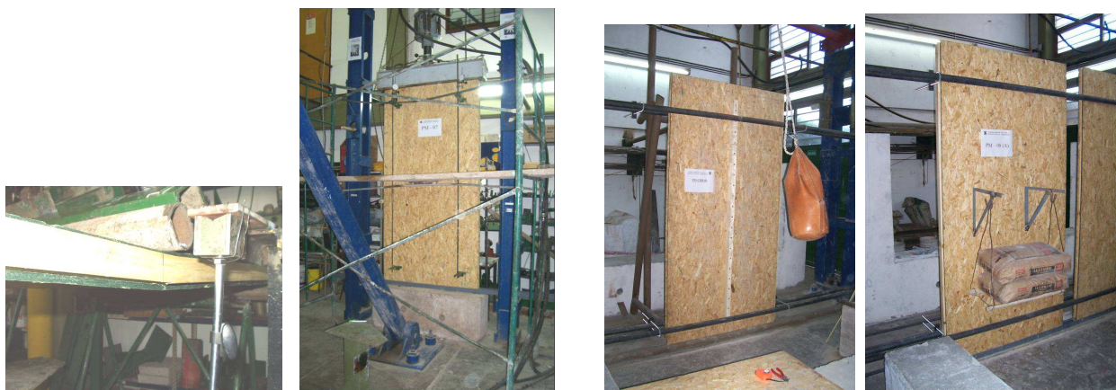
Figure 2: Laboratory tests on OSB Panel