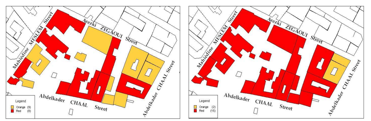
Figures 3 and 4 Classification of the area 135 buildings before and after the Zemmouri earthquake