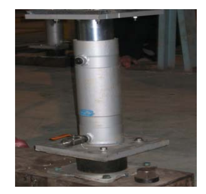
Figure 2 three dimension isolated device

A photo of three-dimension isolated is shown in Fig 2. Thereinto horizontal isolation device is Laminated Rubber Bearing without lead core, its equivalent horizontal stiffness is 0.121 \times 106 N/m, equivalent damping ratio is 0.05( the most displacement is 100%), thus horizontal fundamental frequency of the model is decreased to 1.51 Hz, its vertical stiffness is about 2.27 \times 107 N/m by testing, vertical fundamental frequency of horizontal isolation model is about 20.5 Hz; Thereinto vertical isolation device mainly make up of oil cylinder and inner dish spring.