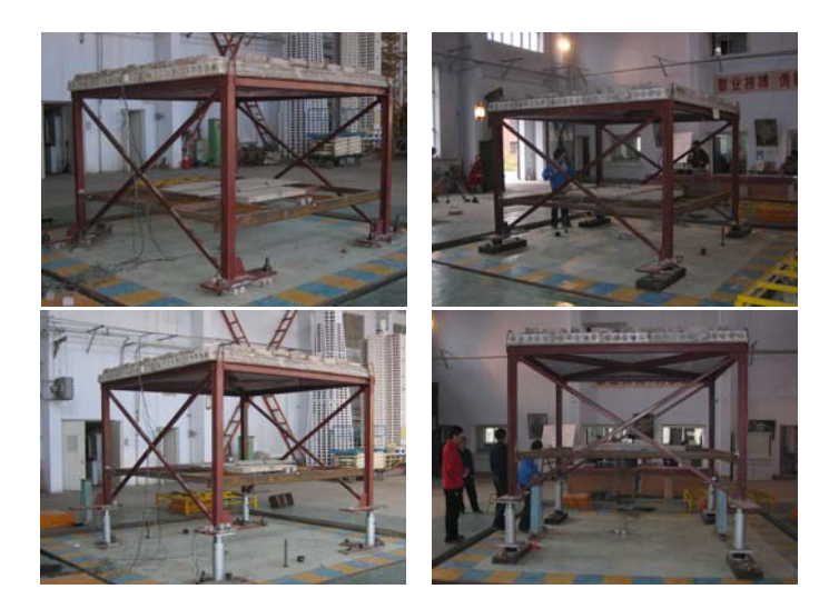
Figure 3 some photos of testing model system