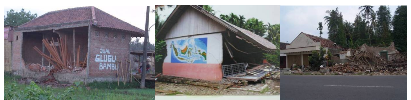
Figure 5. Damages in non-engineered buildings