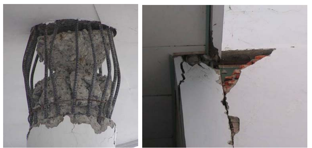
Figure 3. Failed elements and connections.