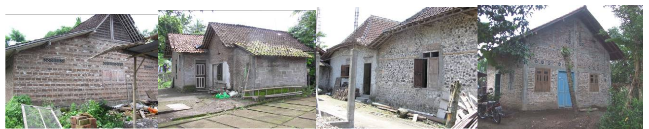
Figure 6 Non-engineered ordinary houses in Indonesia.

Non-engineered structures face many problems during earthquake in Indonesia. Many of these structures have been evolving from vernacular buildings, which used to have good performance in earthquake, toward more common masonry structures such as those found in urban areas. These structures often do not follow minimum requirements for a good confined masonry building, and many of them use locally available materials to give a "masonry-like" features, which are in fact very vulnerable to ground shaking (Boen and Pribadi, 2007). Typical non engineered structures in Indonesia using different types of materials are shown in Figure 6. The picture on the far right shows non engineered structure with good feature of confined masonry.