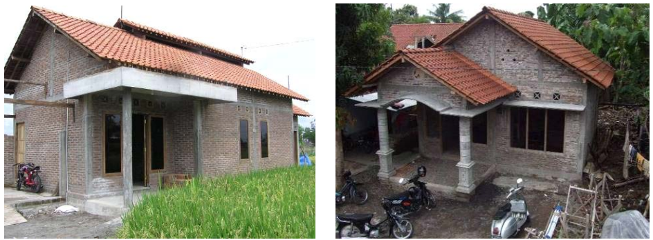
Figure 7 Good masonry houses with heavy canopy.

Construction materials may contribute to the vulnerability of the structures. From the procurement aspect, the lack of availability of qualified construction materials sometimes leads to substitution using any available resources. In the case of Aceh, poorly graded sand and gravels coming directly from the river are often used as concrete aggregates. The use of plain rebars for longitudinal and transversal reinforcement are common, whereas Indonesian seismic code clearly states that plain rebars can only be used for spirals and tendons. The size of rebars used is also a typical problem. Although minimum dia. 12 mm of deformed bar for column longitudinal reinforcements, dia. 10 mm of deformed bar for beam longitudinal reinforcements, and dia. 8 mm plain bar for stirrups are specified in the Indonesian concrete code, smaller diameter bars are often found in practice. Non standardized brick size and quality add problem to the vulnerability of masonry buildings (see Figure 8).