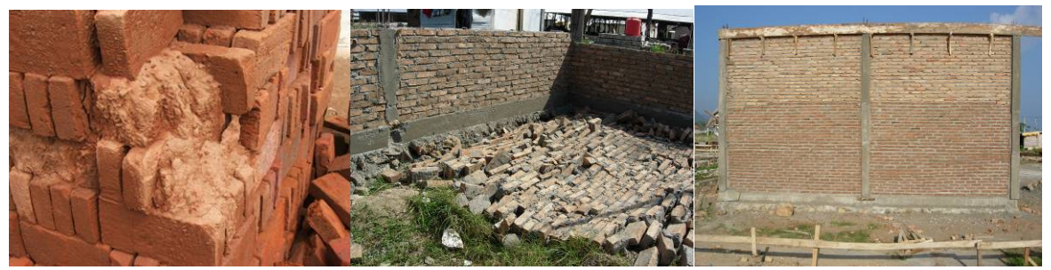
Figure 9. Poor material quality and workmanship, variation of brick quality found in Aceh reconstruction.

In the post recovery efforts, the problems in material aspects are related to the high demand and short supply situation. For instance, 'half-baked' bricks were found to be used in the construction in Aceh. These bricks were poorly built and fell below the minimum strength level of bricks, showed by their inability to be tested for their strength and 'melt' if soaked with water (Figure 9). Another typical problem found was the quality of the concrete mixture. The gradation of aggregates did not comply with the standard material gradation used for concrete mixture. Large aggregates were found in the mixture. Sand was not washed thus silt or clay could be mixed with it, leading to a very poor mixture. Moreover, excessive amount of water also used in the concrete mixture for higher workability, which leads to high water content and low strength concrete.