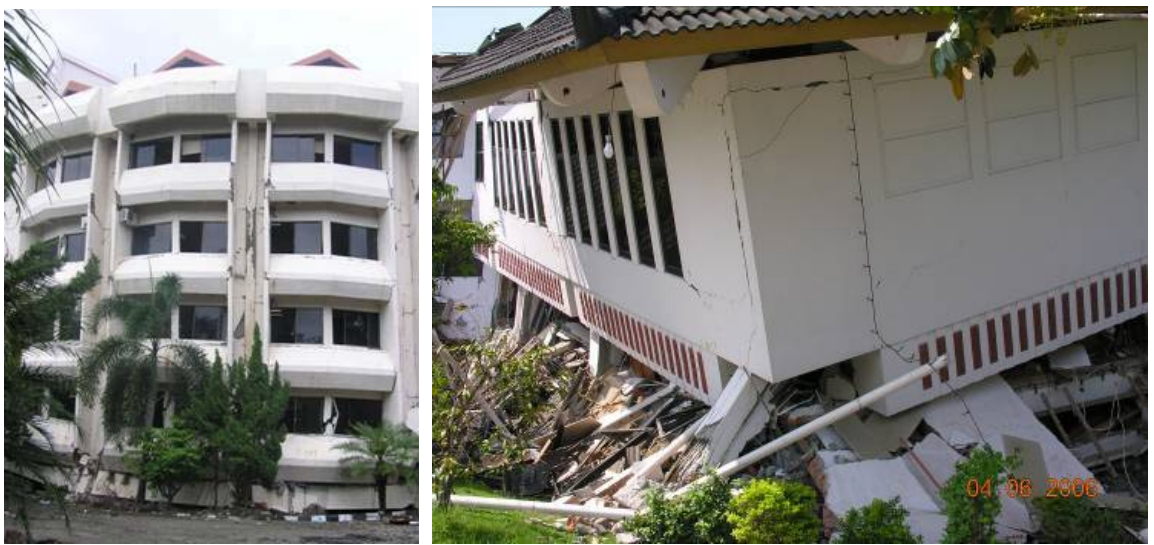
Figure 2. Soft story and weak story effects causing total collapse of structures