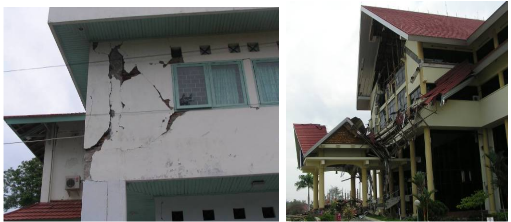
Figure 4. Failed elements and connections.

Figure 5 shows damages occurred on non-engineered structures. These damages usually caused by improper detailing and lack of structural integrity of various components in the building. These problems created separations of structural elements and partial collapse, or total collapse. Most damage occurred on the walls, as these elements were often left unconnected to beams and columns.