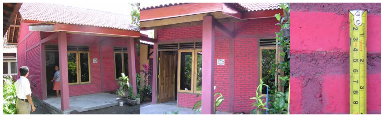
Figure 10. BARRATAGA model houses with adequate structural components and proper brick layering.

masons and built model houses (Sarwidi, 2007). The trained masons were then served as trainers for other masons, thus the concept and knowledge of earthquake resistant structure can be widely spread among the workers.