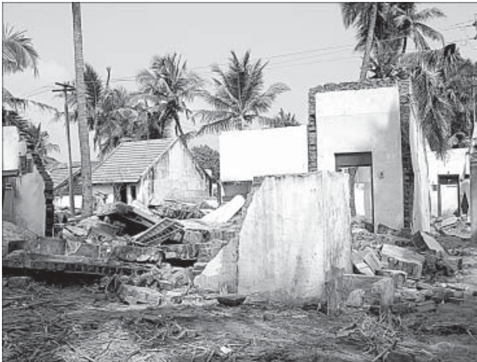
Fig 2 Severe destruction caused by the tsunami waves in Cuddalore district in the state of Tamil Nadu