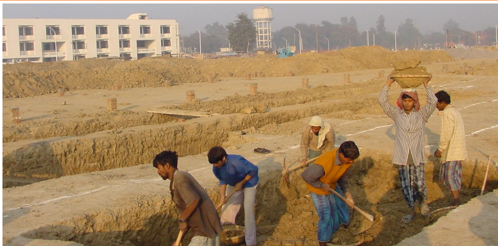
Construction underway for Hall of Residence VIII, which was completed in 2004.