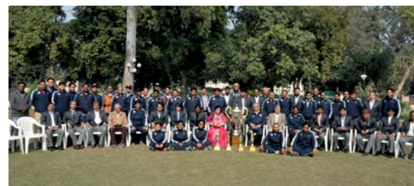
IITK Staff team with the Winner's Trophy.