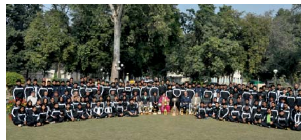
IITK Students' team with the Winner's Trophy.

This is the third year in a row that IITK has been declared general champions of the Inter-IIT Sports Meet.