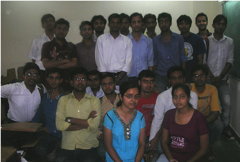
A view of students during the elocution contest