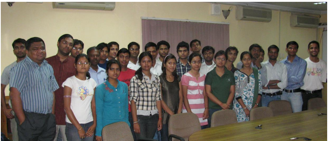
Attendees during Prof. A. Upadhyaya's lecture

This lecture incepted the basics of particulate joining, densification and grain coarsening during sintering of material. Intriguing concepts of surface tension and the gravitational forces affecting the microstructure were fascinating and conveyed the fundamentals of microstructural evolution in W-Cu system.