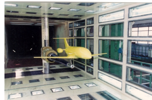
Model Mounted on sting type support System