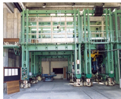
Mobile Interchangeable Test Sections