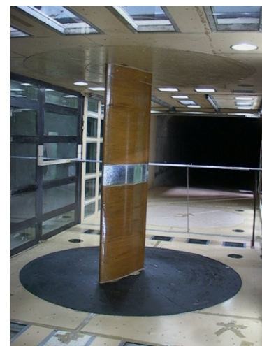
Model Mounted on Turn Table