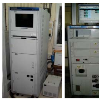
FTIR Raw Emission Analyser

ERL has specialized facilities capable of measuring particulate number-size distribution along with particulate mass, EC/OC, PAH content etc. using advanced equipment such as engine exhaust particle sizer (EEPS), smart particle sampler, EC/OC Analyser, Photo-Acoustic Sensors etc.