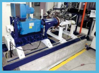
Single Cylinder Optical GDI Engine with Transient Dynamometer