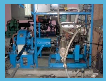
Gasoline HCCI Engine