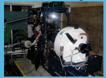
TATA Dicor 2.2L Engine