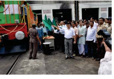
Flagging of ERL Developed First Rebuilt Loco Based on Electronic Fuel Injection System for Indian Railways by Director General, RDSO