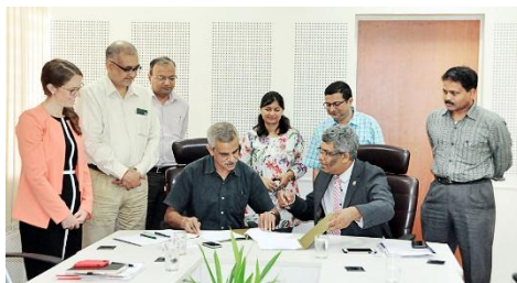
MoU signing with University of Calgary

Technology, Lund University, Luleå University of Technology, McMaster University, University of Calgary, University of Ontario, University of Texas at Dallas, University of Miyazaki, National Ilan University (NIU), Chulalongkorn University, The Nelson Mandela African Institution for Science and Technology.