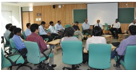
Interaction with TCS Scientists